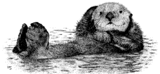
Sea otters perform most of their daily activities – eating, grooming, and sleeping – while floating on their backs.