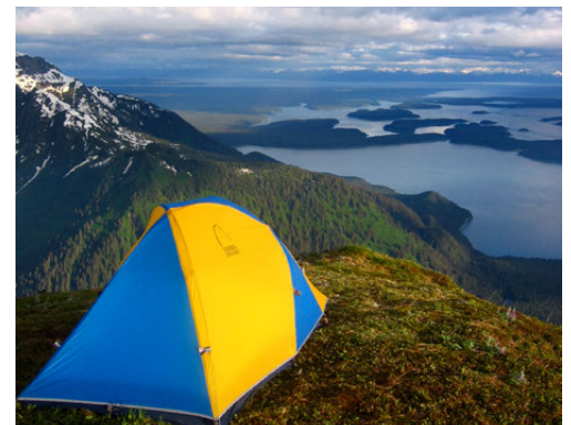
At ~2.6 million acres, the Glacier Bay backcountry is one of the largest designated Wilderness areas in the U.S. National Wilderness Preservation System. The majority of park visitors experience a glimpse of wilderness from the outside looking in (above, left), while others find unique experiences to travel deep into and be fully immersed in wilderness (above, middle and right).