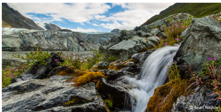
(above, backcountry tidewater glacier, waterfall, moss, and wildflowers).