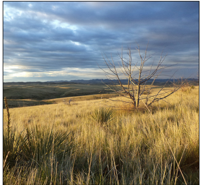
Native bluebunch and western wheatgrasses, yucca, and Rocky Mountain juniper still cover the landscape at Little Bighorn National Monument. Although park managers are tasked to protect the monument's cultural resources, wildfires are still allowed to burn to maintain the native vegetation.

After the United States Cavalry battled the Sioux and Cheyenne on June 25–26, 1876, the Sioux and Cheyenne