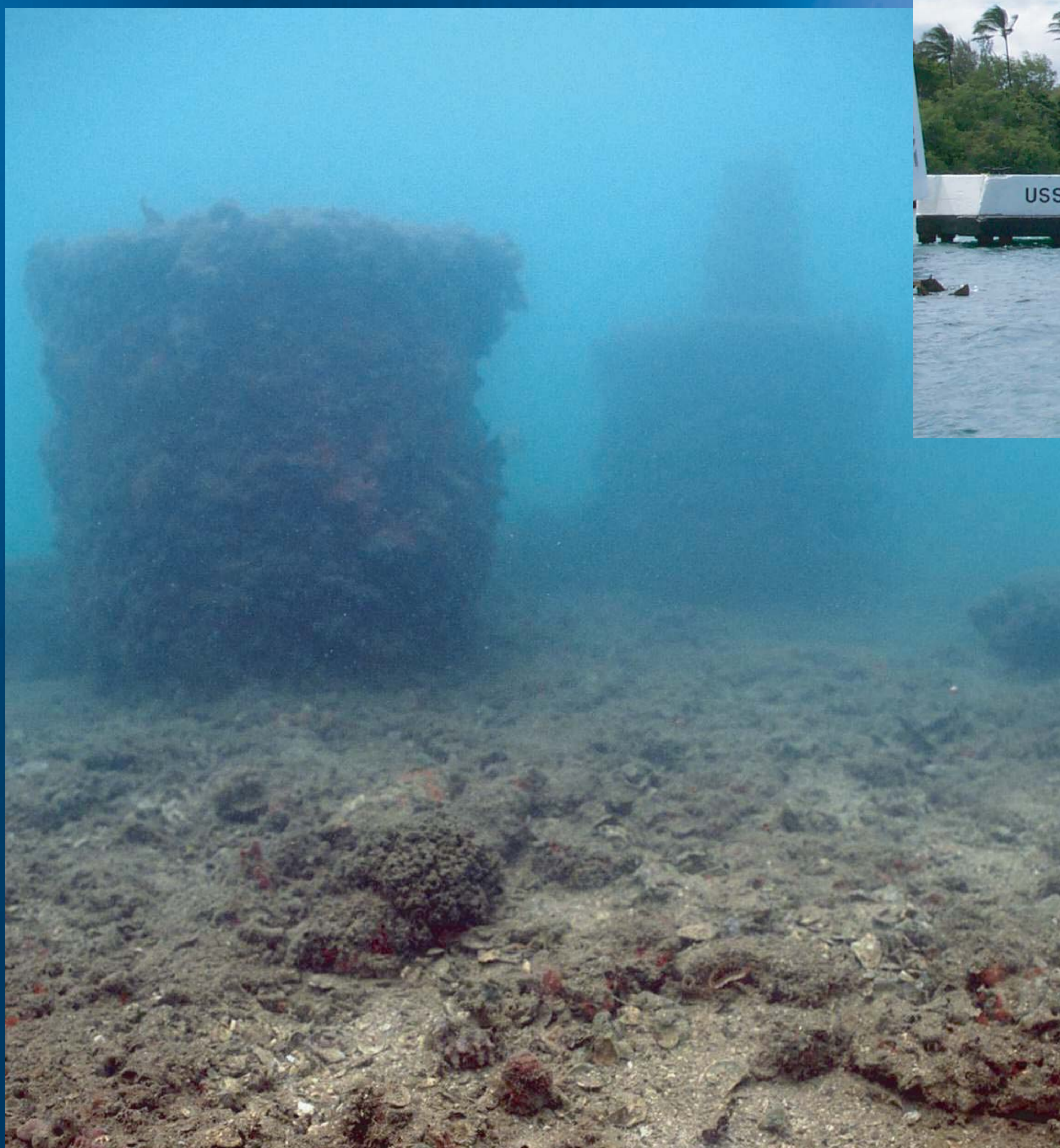
USS Arizona