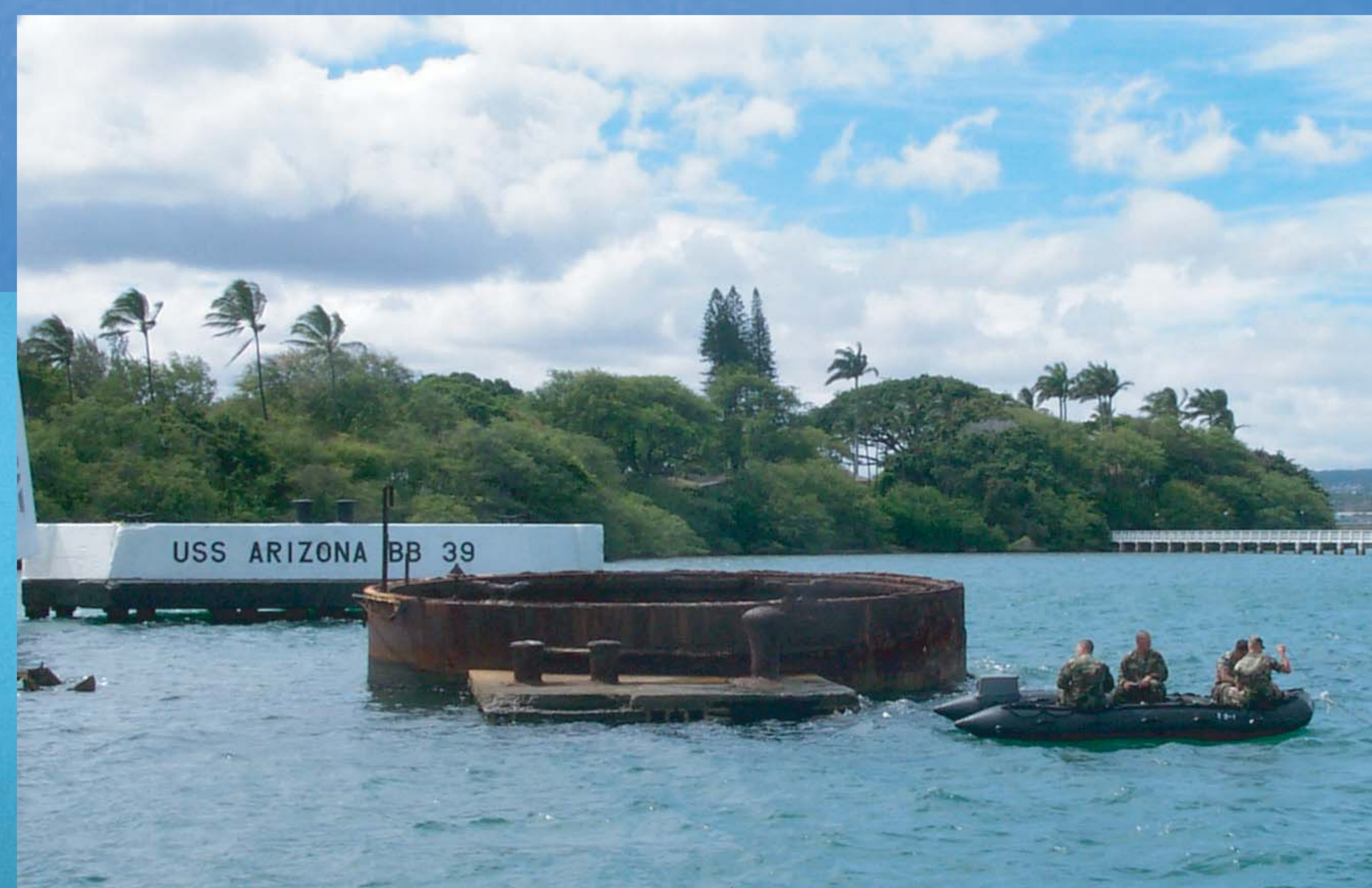
USS Arizona barbette

Today, Arizona lies in exactly the same position as it did after the attack more than 60 years ago. Submerged under 38 feet of water with only portions of its mainmast and its number three barbette above the surface, the ship has been designated a National Historic Landmark to honor those who lost their lives at Pearl Harbor.