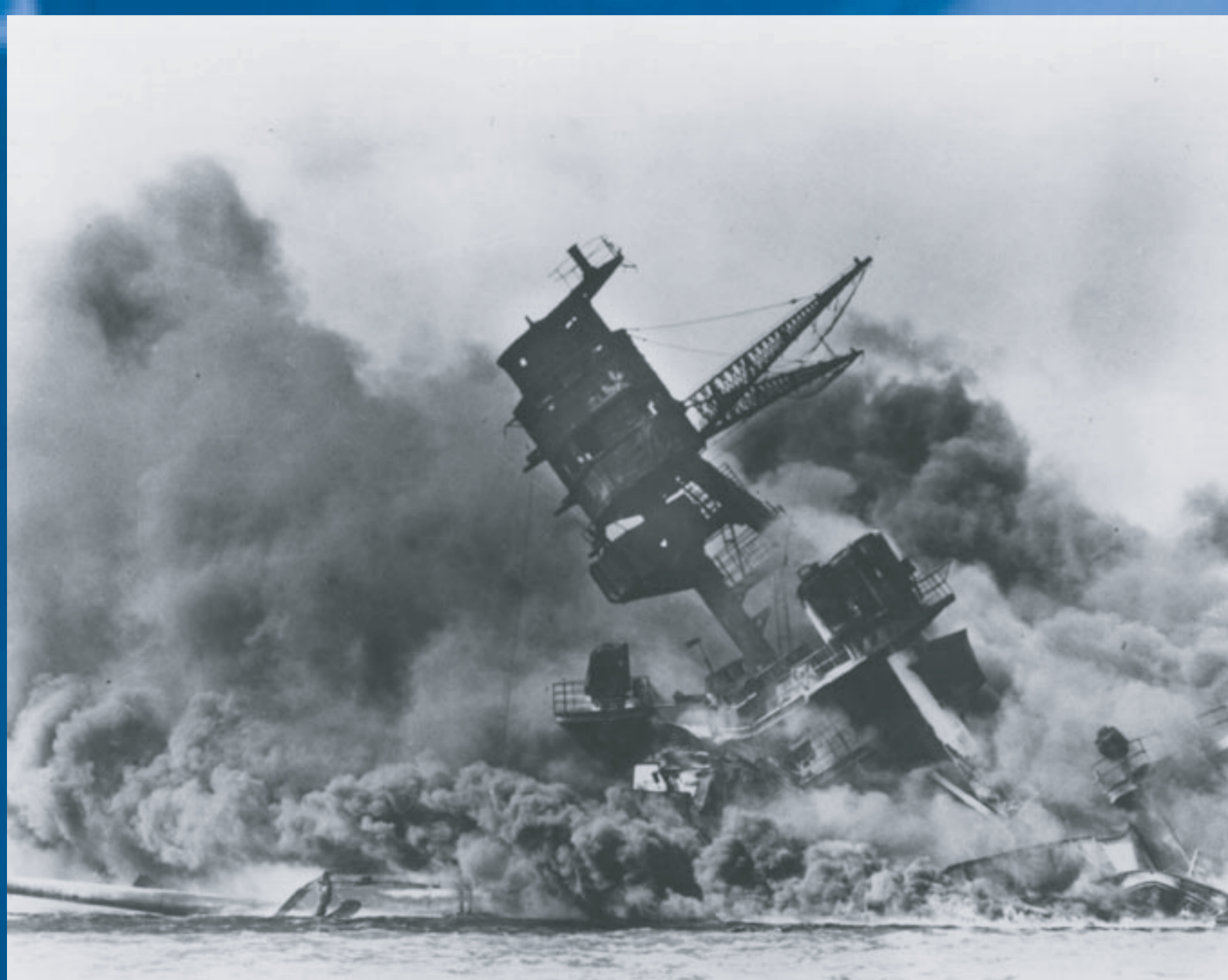
USS Arizona , December 7, 1941.

On December 7, 1941 USS Arizona , bombed by Japanese carrier aircraft, sank in Pearl Harbor. Four bombs hit Arizona , one of which penetrated the upper deck and detonated the battleship's forward ammunition magazine. The ensuing explosion ripped the bow open and killed more than 1100 crewmen, sending the ship to the bottom of the harbor in less than nine minutes.