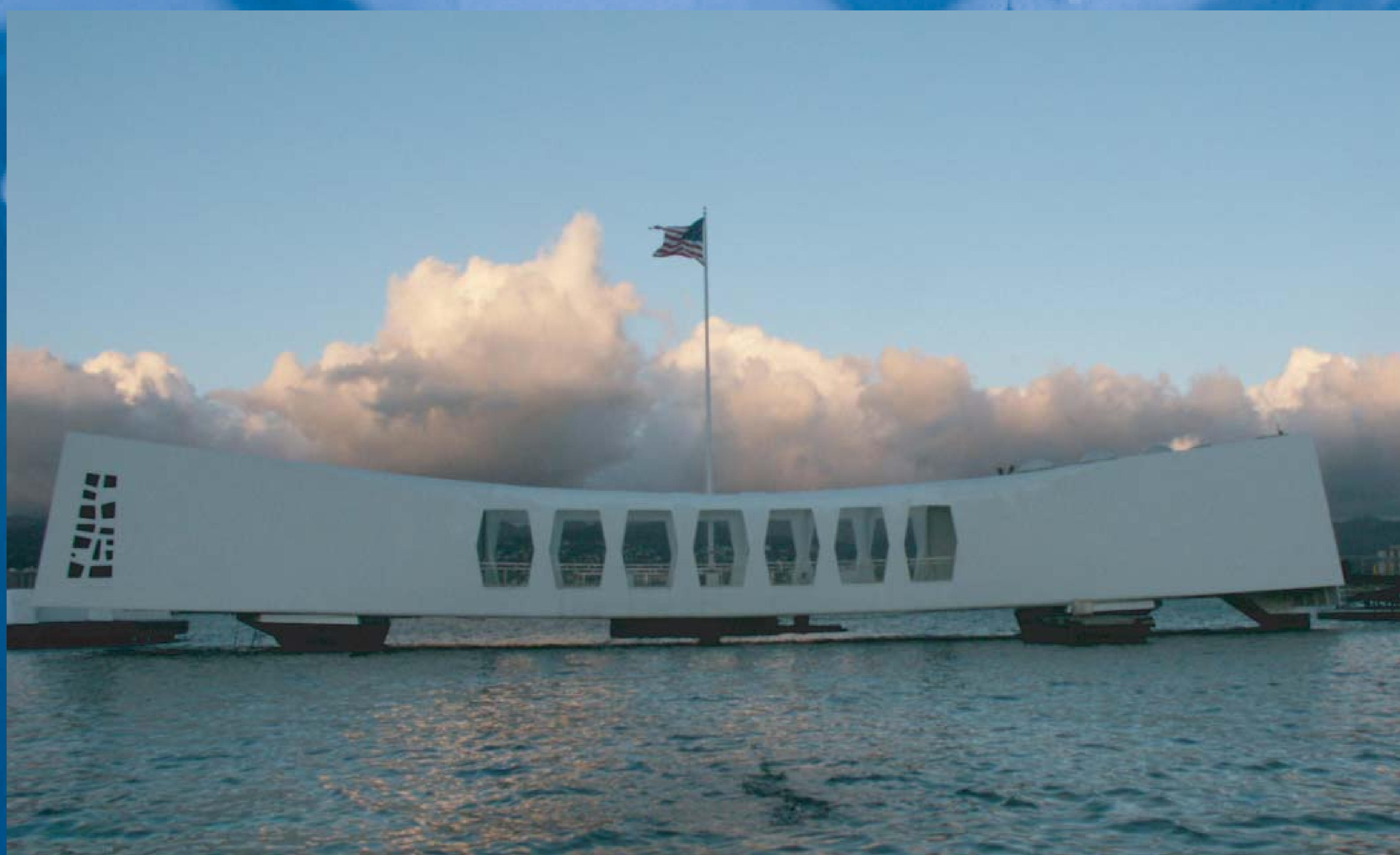
NPS USS Arizona Memorial.

Maintaining the USS Arizona Memorial on Oahu Island, Hawaii, is the responsibility of the National Park Service (NPS), which commits extensive resources to preserving and protecting the wreck as a cultural resource of the United States.