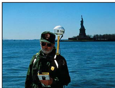
Ellis Island mapping with GPS

Of all the departments within the Federal government, DOI is arguably the one most closely tied to the land. DOI is chartered with managing and protecting the Nation's resources [2], which are geographic in nature (for example, National Parks, Mineral Resources, and Lands Management). Most of the services provided by DOI program and mission areas are associated with a specific location or geographic area. Tracking, providing, and improving the delivery of these services to the public and partners require that information about such locations be collected and managed by the various bureaus. Multiple DOI programs often