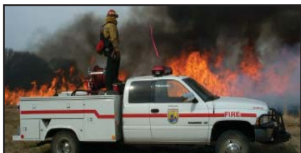
Burning at Eastern Virginia Rivers National Wildlife Refuge