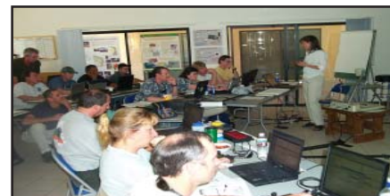
Geospatial training class