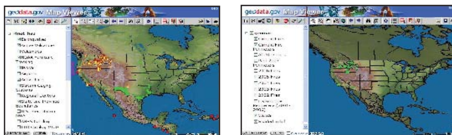
Figure 1. Do you know? You can use the web to find a map or information about many places in the United States? Go to http://www.geodata.gov and explore the possibilities.

perform services on overlapping geographic areas. In fulfilling their mission, bureaus often depend on, or provide, geospatial information along with related geospatial technologies and services. From the creation of maps to the analysis of potential flooding from a hurricane, location information is used for a wide variety of purposes within DOI and by our numerous outside partners (for example, public, states, and counties). With an infusion of mobile, wireless technology, this information can be delivered anytime, anywhere (see Figure 1).