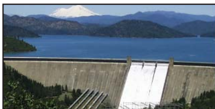
Shasta Dam, Shasta, California