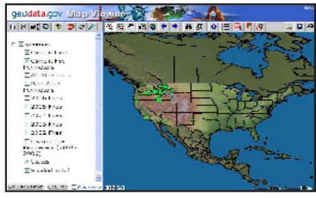
Figure 1. Do you know? You can use the web to find a map or information about many places in the United States? Go to http://www.geodata.gov and explore the possibilities.

DOI's business activities depend on geospatial information—knowing where things are and understanding how they relate to one another. Location information brings data to life and adds value because of the capability of the geospatial technology to generate graphic representations of features to produce a map. This technology helps provide the spatial context that allow for visualization of data, management of information, and data analysis to support DOI's business functions and mission. EGIM provides the ability to more effectively coordinate and support geospatial technologies, sponsoring interoperability and cost effectiveness for each of the bureaus within the DOI (see Figure 2).