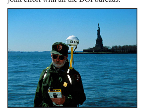
Ellis Island mapping with GPS

The Enterprise Geographic Information Management (EGIM) [1] initiative of the U.S. Department of the Interior (DOI) is a framework for the standardization and coordination of geographic information systems (GIS) activities across the department's bureaus. The purpose of the EGIM team is to provide strategic leadership for that enterprise GIS effort within DOI. A DOI team of bureau representatives and subject matter experts collaborate to determine the need for standardization, GIS initiatives, direction on policy, program initiatives, funding priorities, and organizational needs, as well as the coordination of GIS activities among bureau programs and areas. EGIM is a joint effort with all the DOI bureaus.