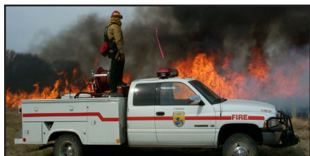
Burning at Eastern Virginia Rivers National Wildlife Refuge