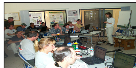
Geospatial training class