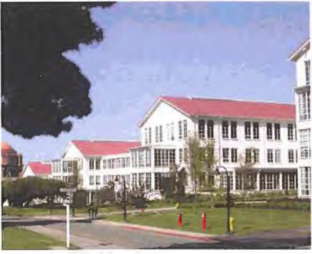
Letterman Digital Arts Center

All of the buildings included in this offering are listed as contributing features to the Presidio's National Historic Landmark District designation. Rehabilitation of these buildings and associated landscapes must be carried out in accordance with the Secretary of the Interior's Standards for the Treatment of Historic Properties and may gualify for Federal Historic Tax Credits.