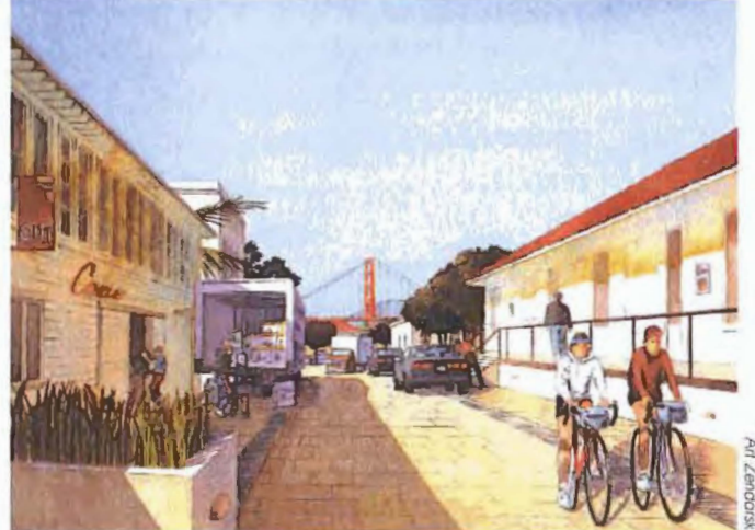
Thornburgh view looking West