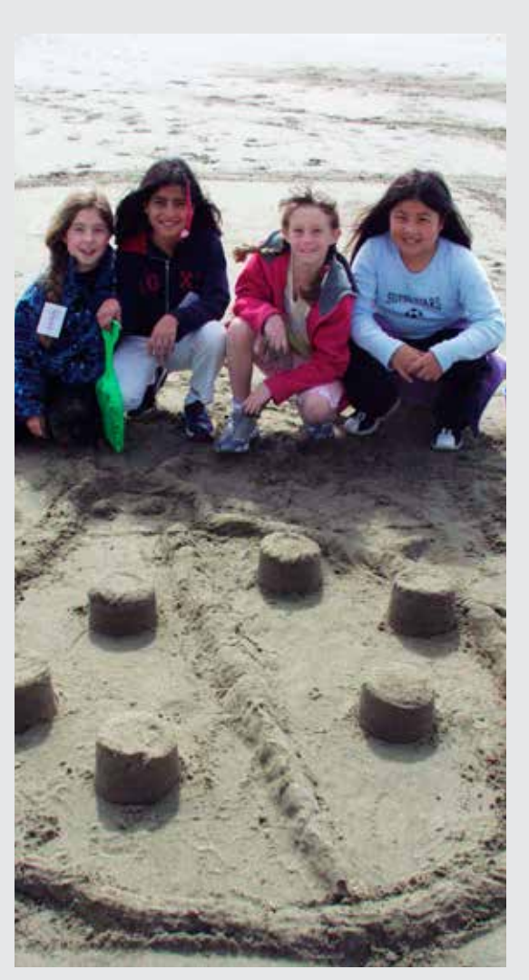
Class at Crissy

Once the Trust has had an opportunity for an initial review of the final proposals, the public has seen and commented on the final proposals, and the Trust has engaged the proponents in conversation, the Trust will determine the compliance and decision-making process that the agency will undertake.