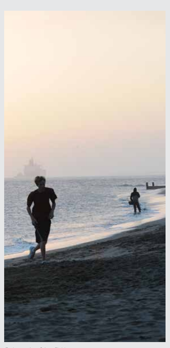
Early morning, Crissy Field

Refer to the "Use and Disclosure" for information about the federal Freedom of Information Act (FOIA), and use and disclosure of submittal documents.