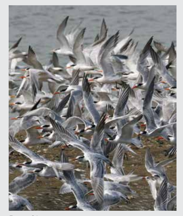
Terns on Crissy

Finally, provide a summary that reiterates how your proposal would advance each of the Trust's six goals for a cultural facility at the former Commissary site.