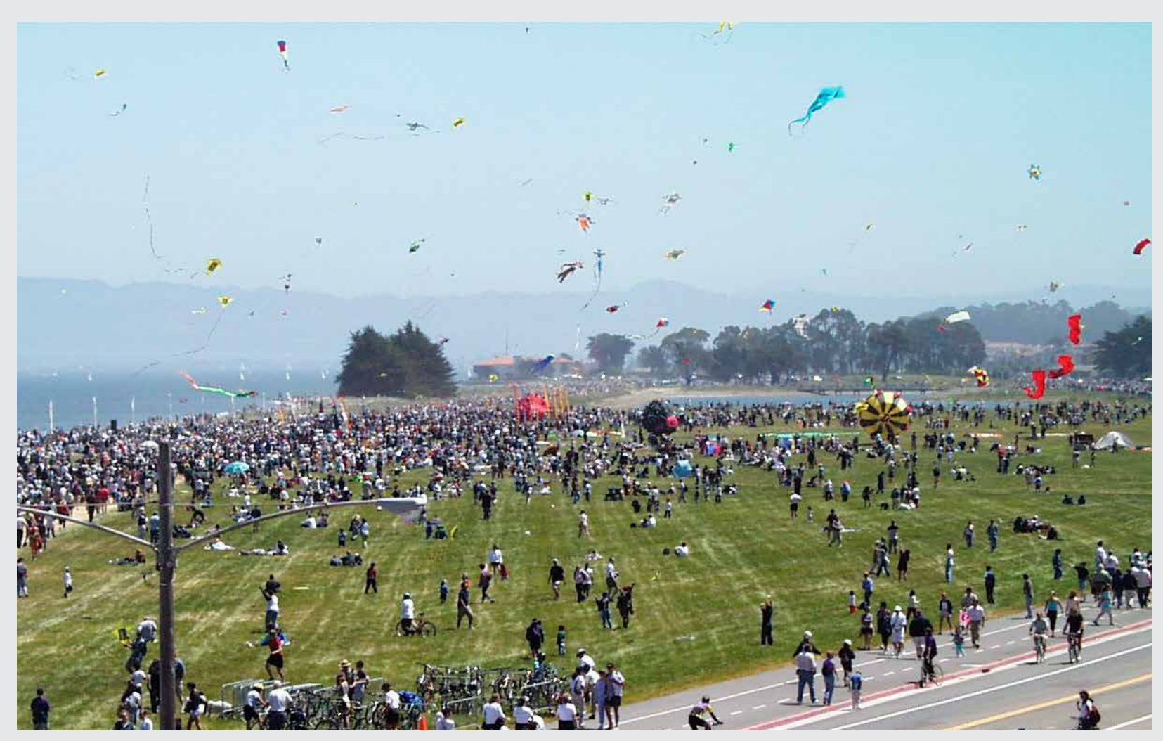
Crissy Field, Opening Day, May 2001