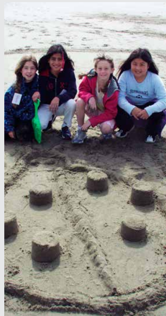
Class at Crissy

Once the Trust has had an opportunity for an initial review of the final proposals, the public has seen and commented on the final proposals, and the Trust has engaged the proponents in conversation, the Trust will determine the compliance and decision-making process that the agency will undertake.