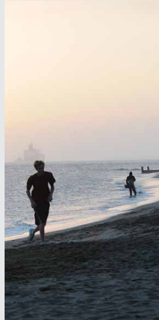
Early morning, Crissy Field

Refer to the “Use and Disclosure” for information about the federal Freedom of Information Act (FOIA), and use and disclosure of submittal documents.