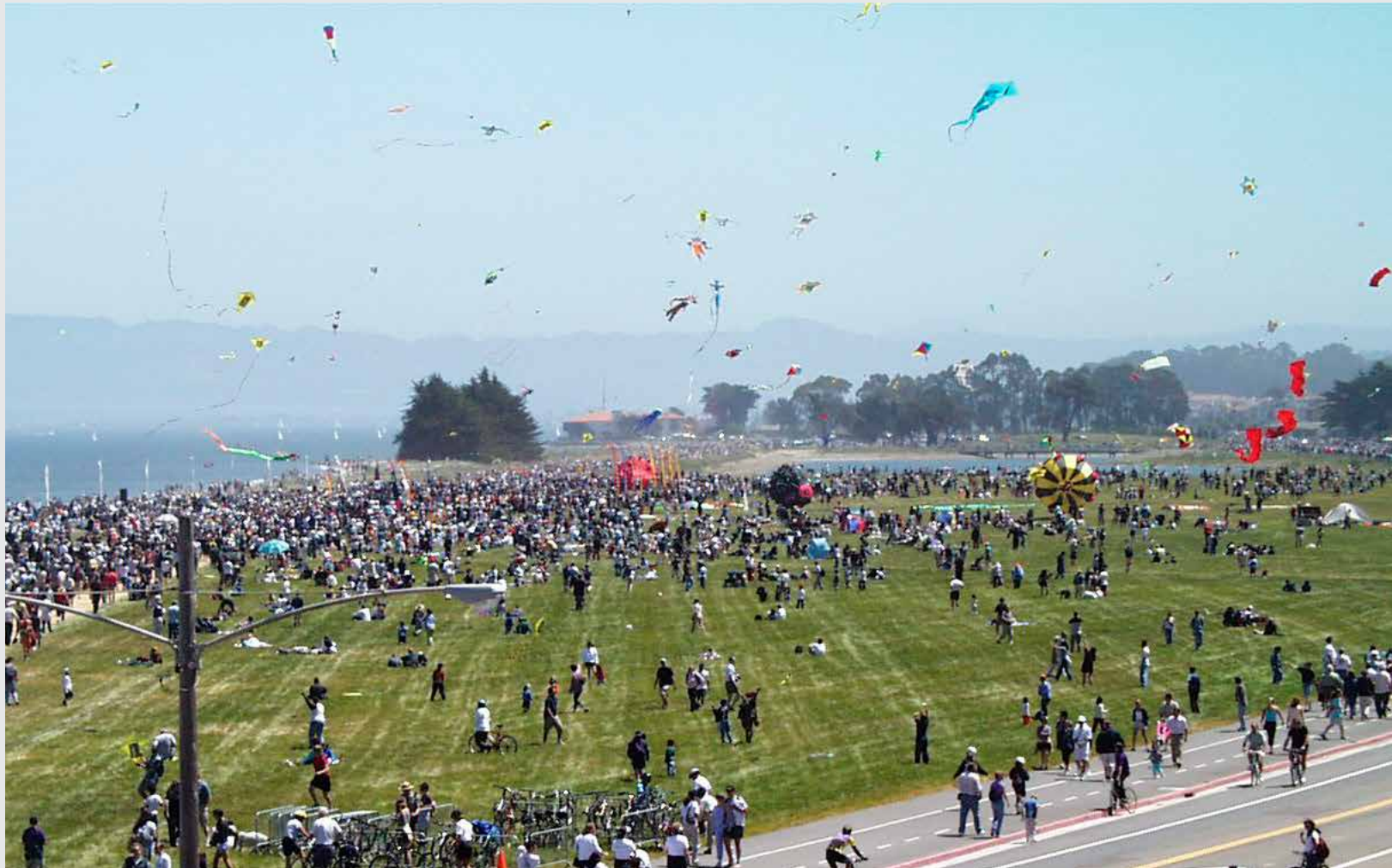
Crissy Field, Opening Day, May 2001