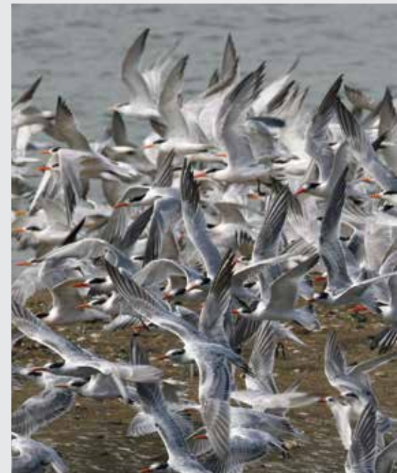
Terns on Crissy

Finally, provide a summary that reiterates how your proposal would advance each of the Trust's six goals for a cultural facility at the former Commissary site.