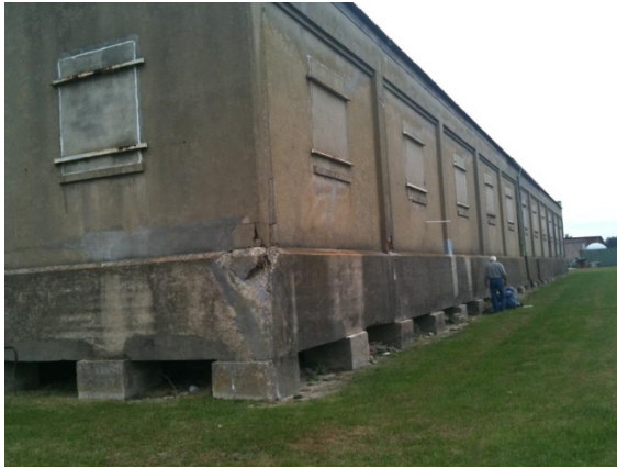
Building: 61: Exterior