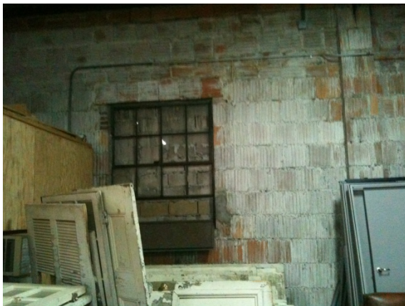
Building 61: Clay Tile Wall