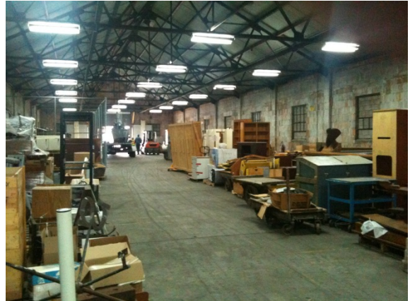
Building 61: Interior