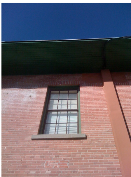
Building 115 – Window & Eave