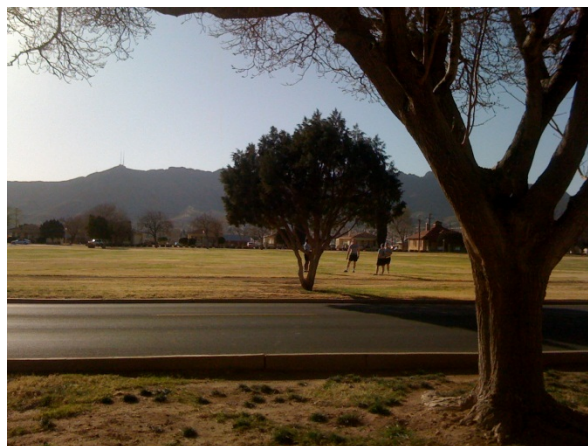
Building 115 – Site Context