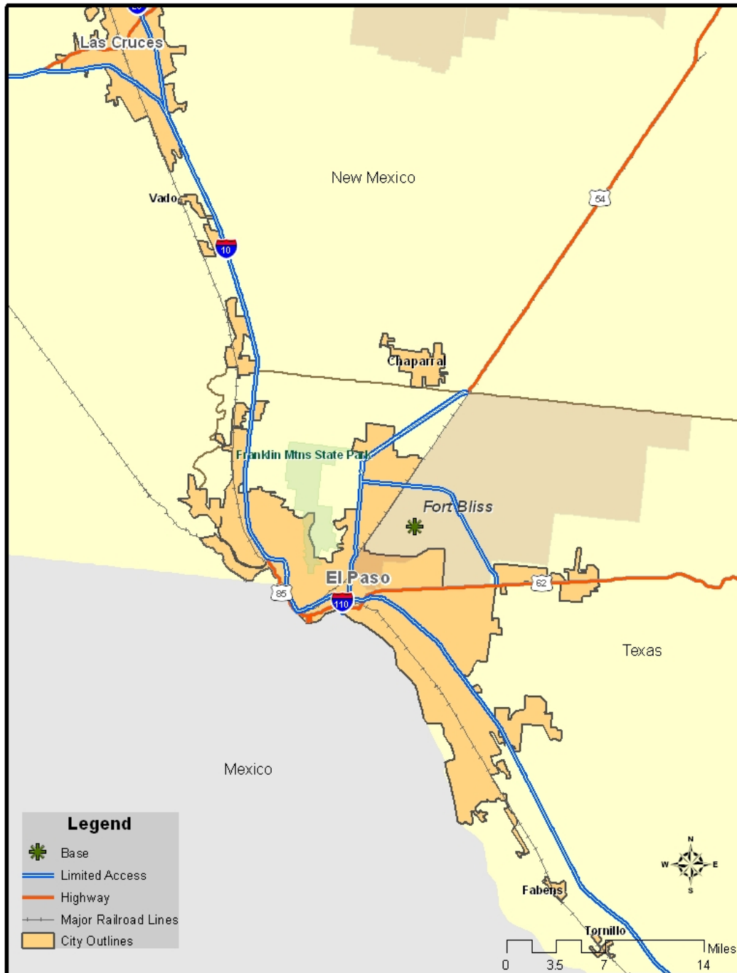
Figure III-1 Location of Fort Bliss El Paso, Texas