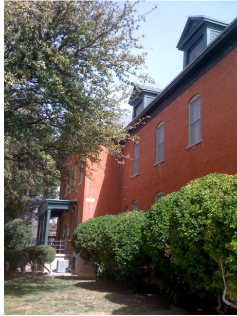
Building 1 - Exterior