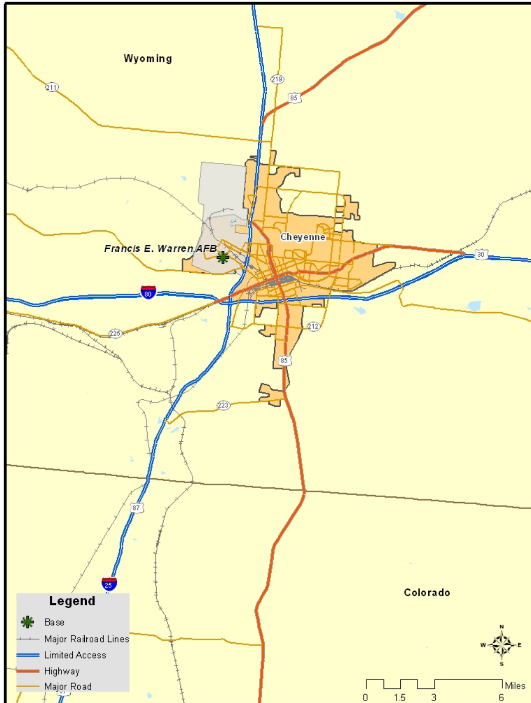
Figure III-7 Location of Francis E. Warren Air Force Base Cheyenne, Wyoming