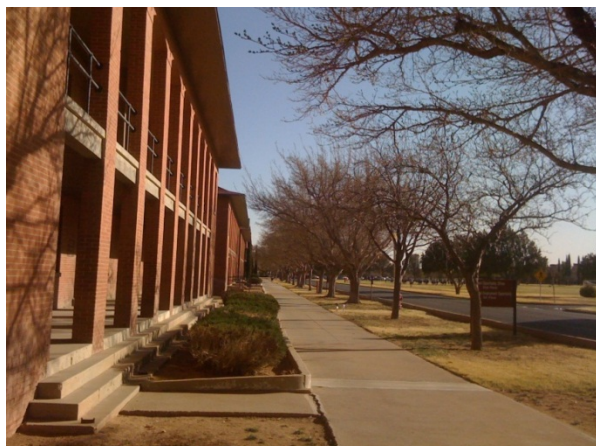
Building 115 – Front on Pershing Road