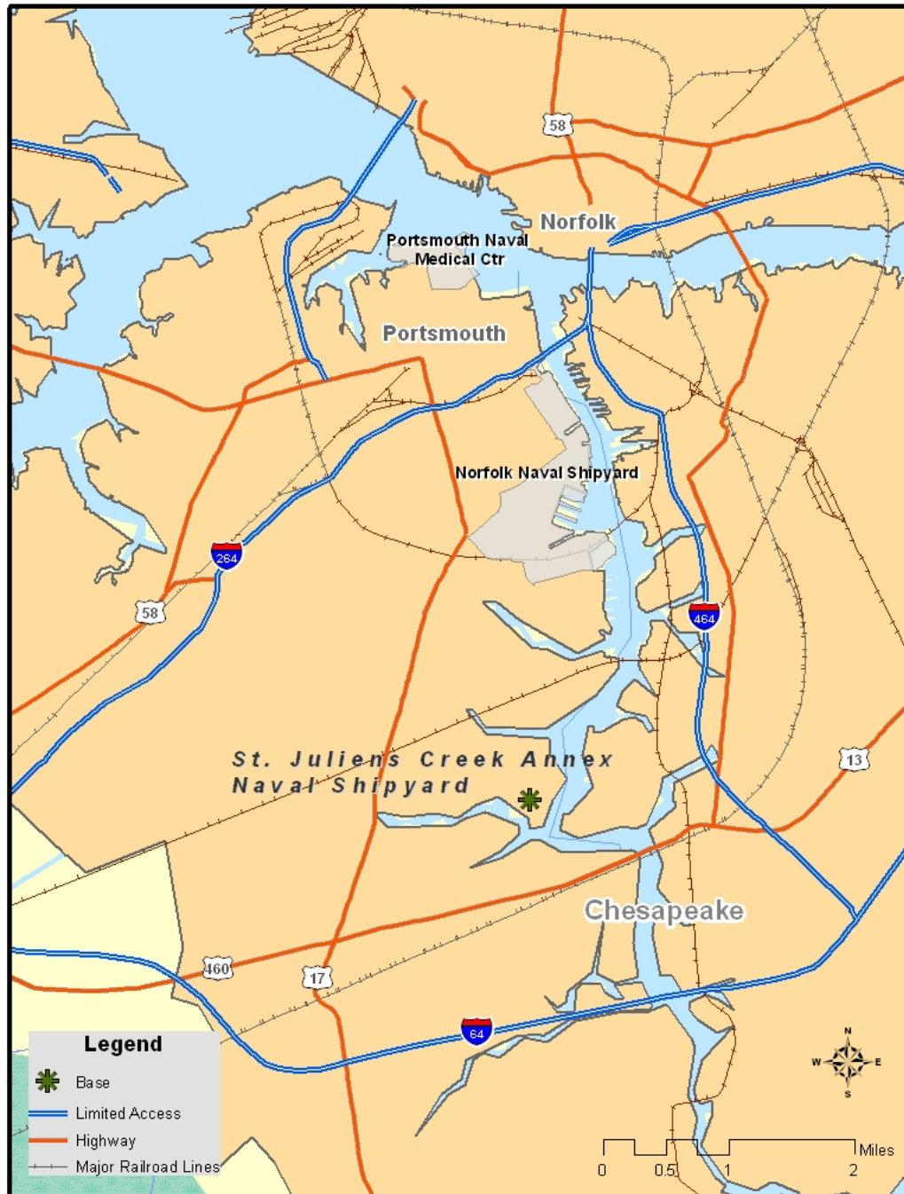
Figure III-4 Location of St. Juliens Creek Annex Chesapeake, Virginia