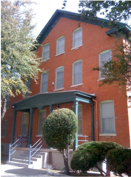
Building 1- Typical Entry