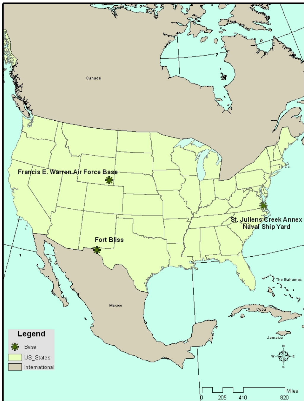
Figure II-1 Location of Selected Military Installations