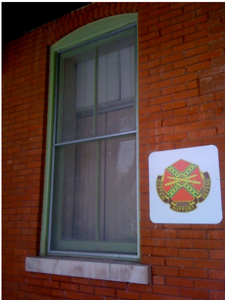
Building 1- Typical Window