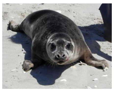
The NPS balances preservation of historic structures with care for wildlife habitats and natural resources. Three varieties of seals overwinter here on a sandbar in the bay.

Proposals may be delivered in person, by U.S. Mail, or by another delivery service. Submission of proposals by telephone, fax, e-mail, or other methods will not be considered. Proposals will not be returned.