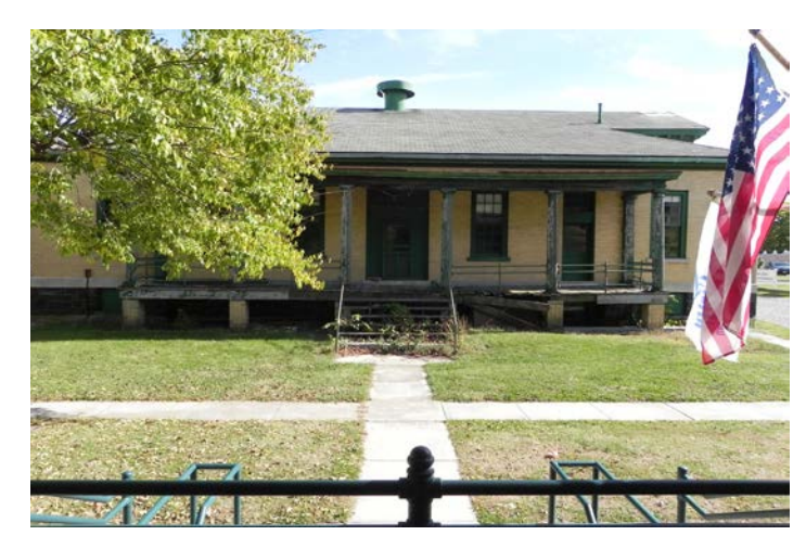
TOP PHOTO: Building 55, one of three former Mess Halls available for BOTTOM PHOTO: Building 60, former Gas Station. Behind Building 60 is the former gym, Building 70 NPS PHOTOS.

Constructed in 1905, these buff-brick buildings have 6,676 square feet of space. Mess Hall Buildings 55-57 are three of four, originally identical, 140-man mess halls designed and constructed as part of the second phase of building at Fort Hancock during 1904-1905. Each building has a hipped roof with large, gable-end dormers to the north and south. Each building is symmetrical with seven bays on the east and west elevations and four bays on the north and south elevations. Each building has a large, five-bay wide porch on the west with a low slope, hipped roof. On the east, there is a smaller, two-bay wide porch with a lowslope roof. Limited public parking is available across from Building 57.