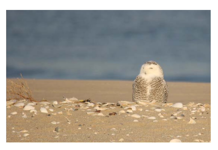
Snowy owls on Sandy Hook's beach? Yes, during some winter seasons at Sandy Hook, which provides important habitats for birds and animals year-round.