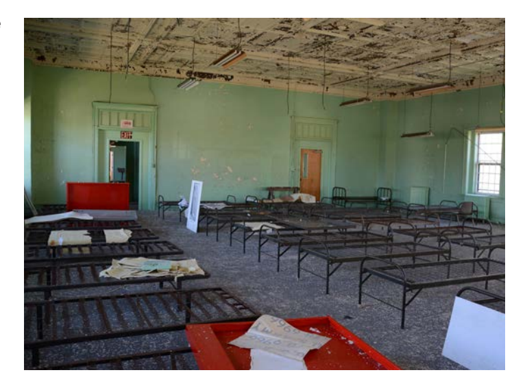
Buildings 23-25 were formerly used as barracks for dozens of soldiers.

The appropriate standard for most of the projects completed under this Lease agreement will likely be SOI standards. To be in conformance with the SOI standards all efforts should be made to retain and repair the historic fabric, and if deteriorated beyond repair, replaced in-kind. When developing cost estimates in conjunction with proposals and corresponding construction schedules, Applicants should consider the cost to repair existing character defining features and components, rather than replacing.