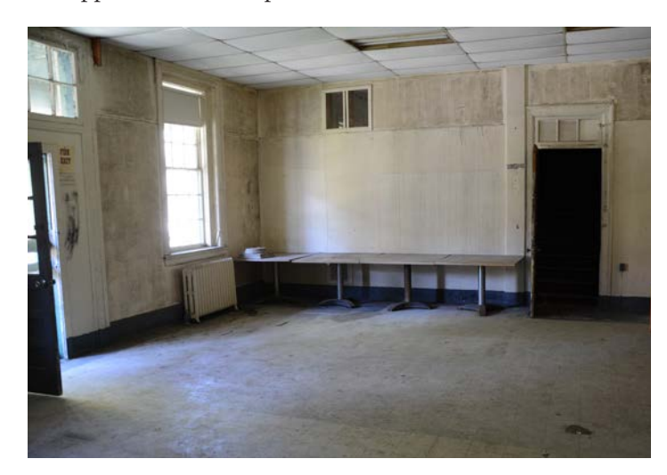
Former mess hall. Building 55.