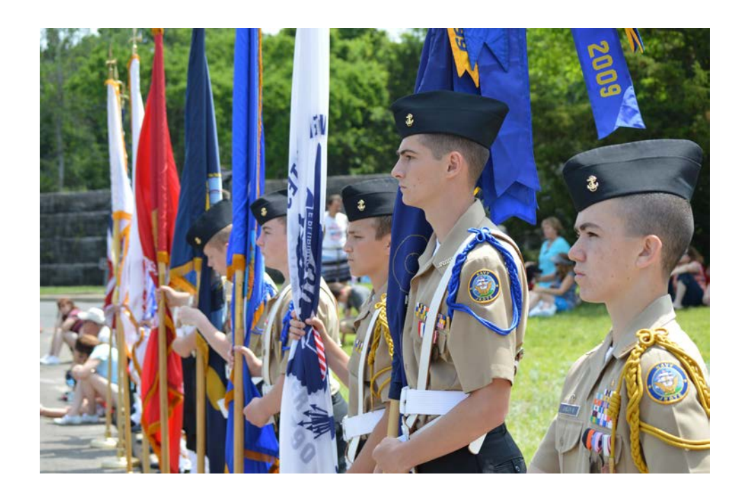
Fort Hancock's own Marine Academy of Science and Technology (MAST), a Monmouth County vocational high school located here, offers both a Junior ROTC program and several classes with hands-on learning about coastal habitats.

Section 106 compliance. Archeology monitoring shall be paid for by the tenant. Asphalt and concrete repair and ground repairs, i.e. seeding costs, must be borne by the tenant and will be subject to the NEPA/106 compliance process. If the video shows a deteriorated pipe, the park may allow that the pipe to be lined in lieu of an open cut construction replacement. Any repairs will require park approval of plan and schedule. All work will be completed according to the latest New Jersey Code and constructed to industry standards.