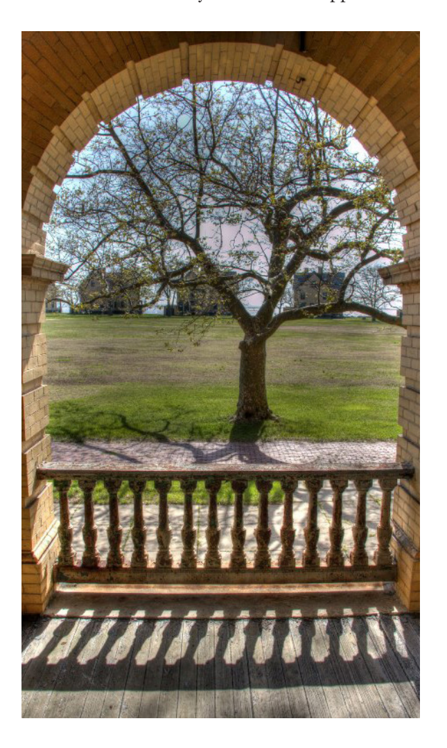
Design and Construction Requirements

Alterations and improvements to the historic structures and landscapes, within Fort Hancock and Sandy Hook Proving Ground NHL District, must be made in a manner consistent with the Secretary of the Interior's Standards for the Treatment of Historic Properties (SOI). They must also be reviewed and approved by NPS and may require consultation with SHPO as necessary. Simple maintenance projects do not typically require this level of review. Exterior and interior character defining features must be maintained as part of any rehabilitation efforts made by the successful applicant.