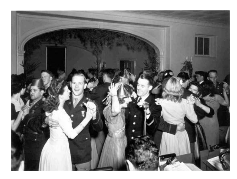
Officers and enlisted soldiers celebrated holidays at Fort Hancock with parties, dances and entertainment.