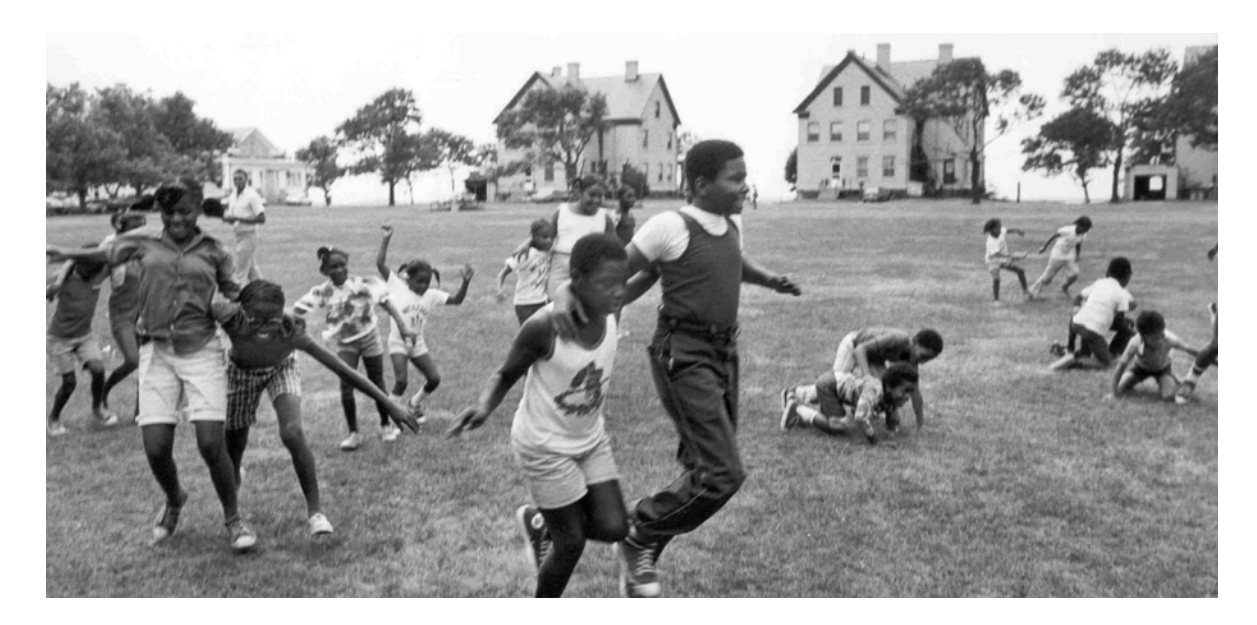
IN 1972, an Act of Congress created Gateway National Recreation Area. Sandy Hook was included. Once the US Army left on December 31, 1974, the new national park began offering a variety of programs for youth and students.

l. Light Fixtures/Electrical: The electrical and lighting systems in many of the buildings have not operated in many years and do not meet current code and energy efficiency standards. It is assumed that the installation of new systems including fixtures, wiring, and panels will be required.