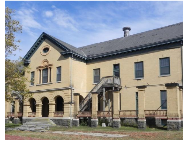
Buildings 24 (above) and 25 (below) Former Barracks Proposed residential use One Bedroom/Studio Mix