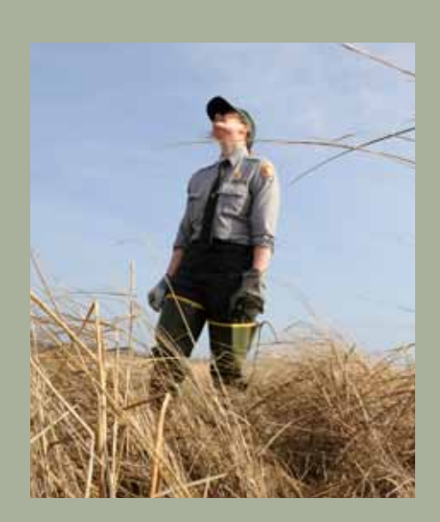
US Department of the Interior National Park Service Gateway National Recreation Area 210 New York Avenue Staten Island, NY 10305