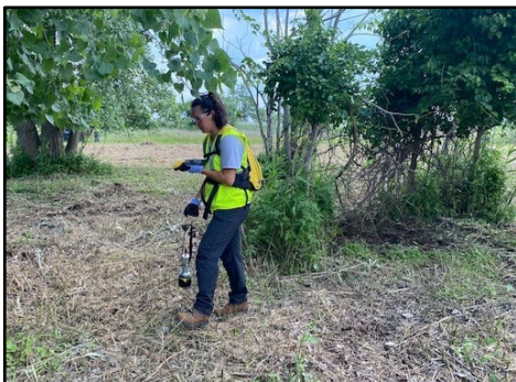
Gamma Walkover Survey

In 2017, NPS initiated response actions pursuant to its cleanup authority under the Comprehensive Environmental Response, Compensation, and Liability Act (CERCLA), also referred to as Superfund, to investigate the nature and extent of contamination resulting from the City’s historical sanitation operations at the Site. As the CERCLA “lead agency” at the Site, NPS plans the Site investigation and cleanup activities. Since 2017, NPS has initiated and completed several CERCLA investigations at the Site. Based on these investigations, NPS determined in the fall of 2020 that it was necessary to initiate a CERCLA Remedial Investigation/Feasibility Study (RI/FS).