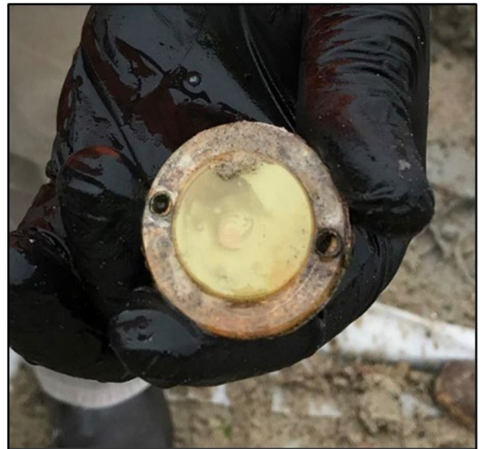
Deck marker containing radium

The greatest potential risk from radiological Site contaminants results from coming into direct contact with man-made radiological articles and the ingestion of contaminated soil. Exposure, and ultimately risk, from an actual man-made radioactive article depends on the amount of time and how close you are to it. Both man-made articles and contaminated soil are known to exist at the surface at the Spring Creek Park Site.