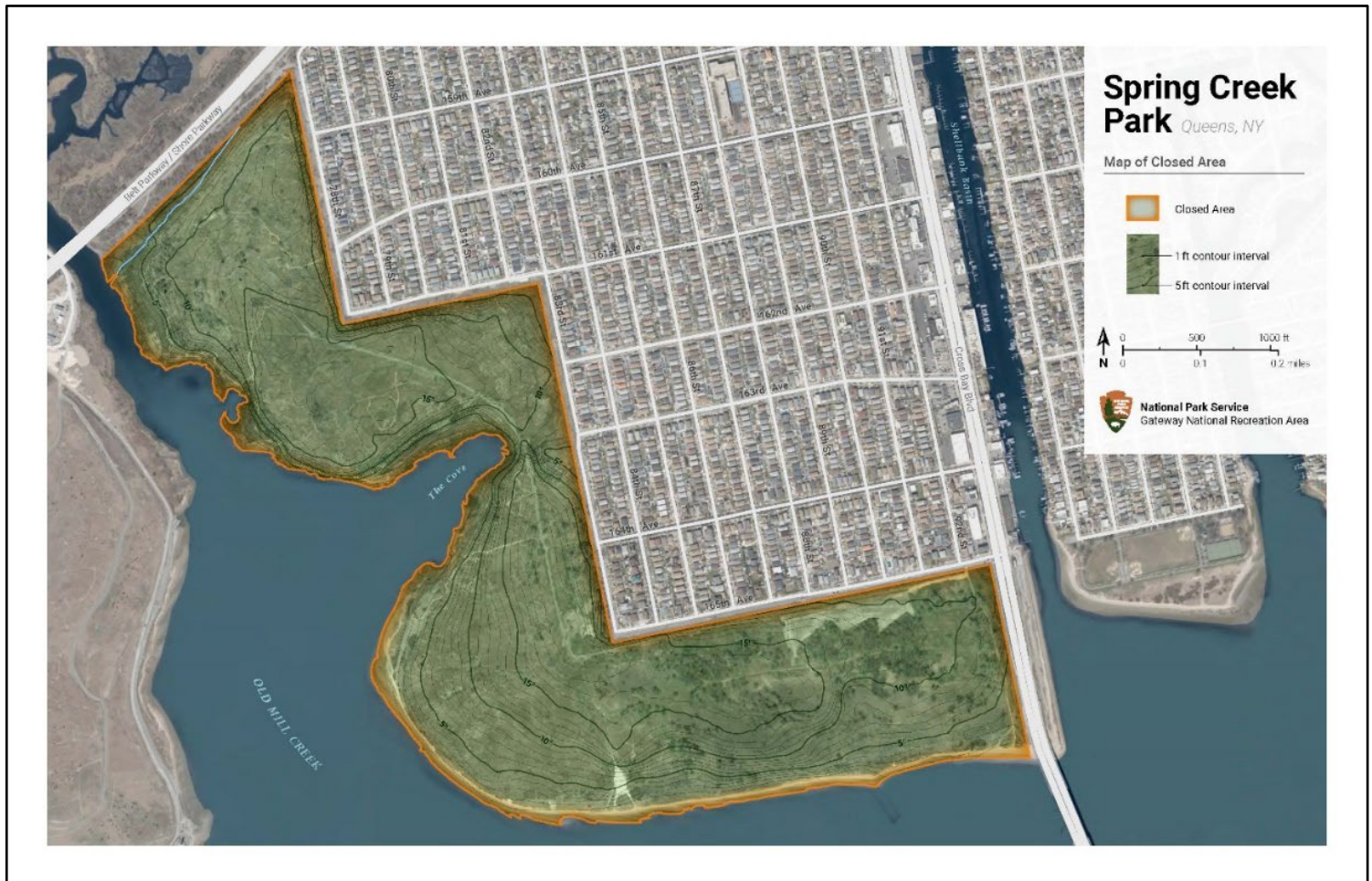
Spring Creek Park – Closed Area

The results of the RI will provide the foundation for how NPS will evaluate cleanup alternatives in the Feasibility Study (FS) to ensure Site conditions are protective of human health and the environment and allow for the continued use of Spring Creek Park by the community once the remediation is completed. The results of the RI and FS will be presented in a combined RI/FS Report. NPS will then develop a Proposed Plan for public review and comment, which will outline the preferred cleanup option identified for the Site. Public feedback will be sought and considered prior to finalization of the Proposed Plan, which will be documented in the Site Record of Decision (ROD). Once the ROD is finalized, NPS will prepare the Remedial Design and commence Remedial Action in all areas of Spring Creek Park determined to require cleanup.