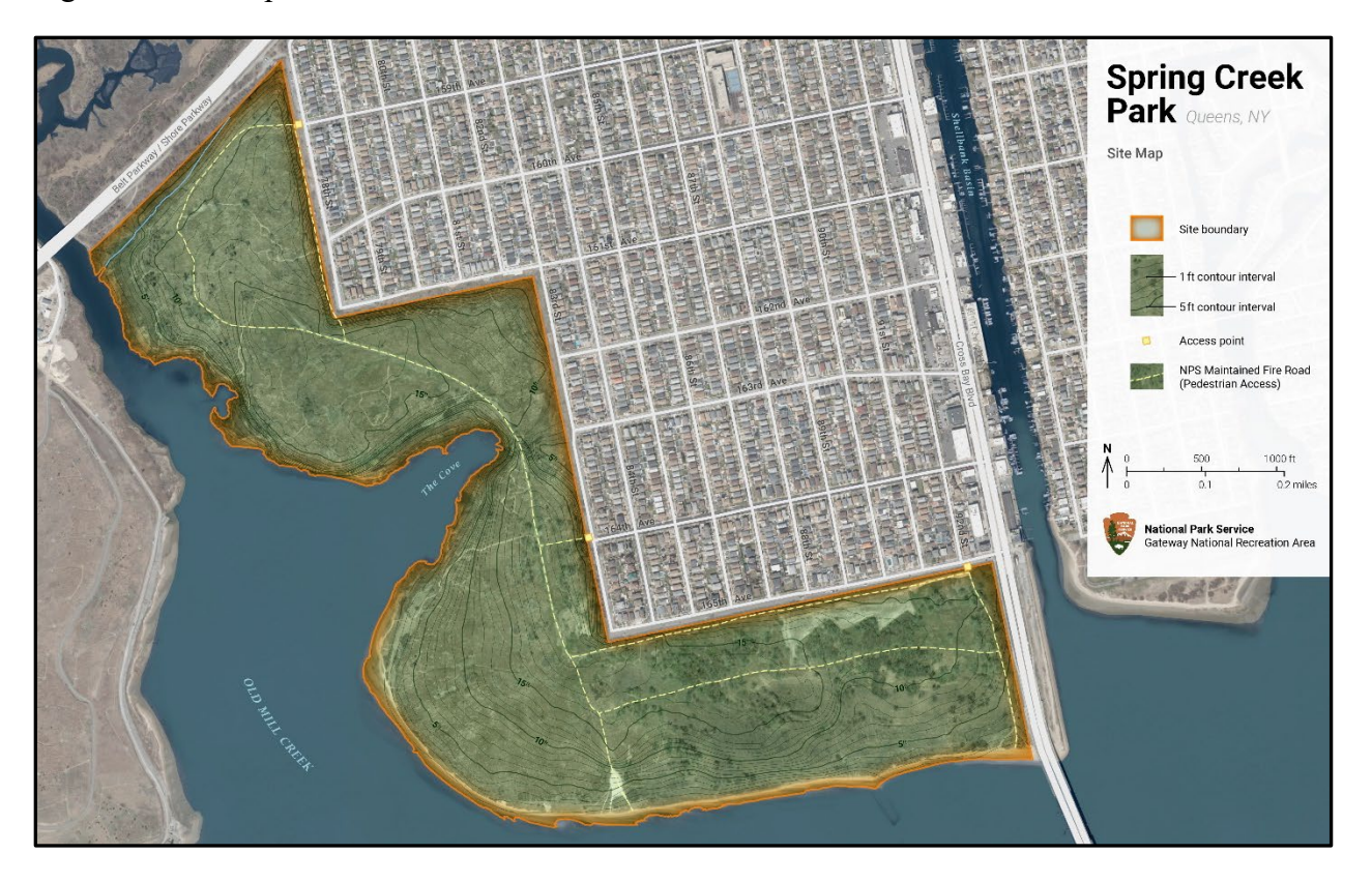
Figure 2. Site Map Detail

The community surrounding Spring Creek Park includes the Howard Beach neighborhood, Old Howard Beach, Hamilton Beach (across Shellbank Basin) and Lindenwood, north of Belt Parkway. This area has an estimated population of 29,219 according to the 2018 American Community Survey. Approximately 68% of the population is White, 5% Asian, and 2% African American (NYC Department of City Planning, 2020). Almost a quarter of residents are Hispanic or Latino (of any race). Slightly more than one third of residents have Italian ancestry and a tenth Irish ancestry. In this area, 20% of residents were born in a foreign country, primarily from countries in Latin America and Europe. Regarding language, nearly 35% speak a language other than English and 10% of these speak English less than very well (NYC Department of City Planning, 2020). This amounts to approximately 2,900 people. Of these,