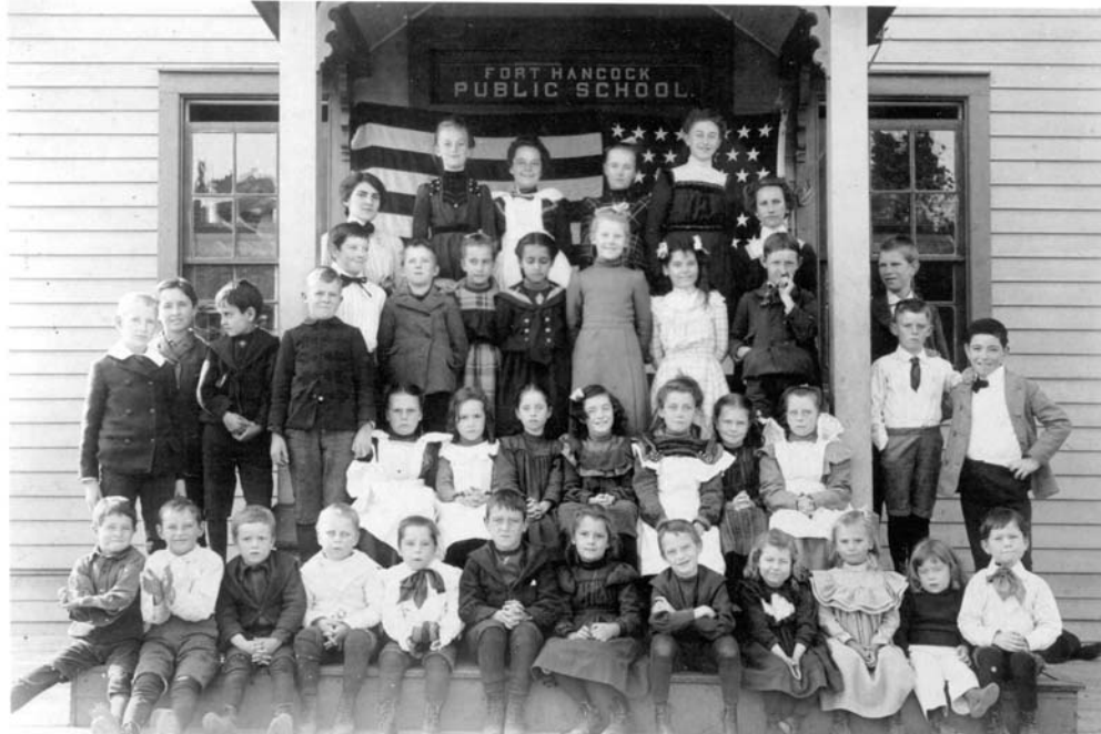
1 st Fort Hancock School, c. 1900

EH: Do you recall the outside of the building, the exterior? Was it clapboard?