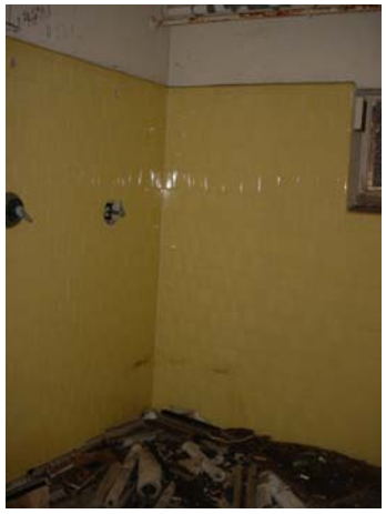
Inside shower area of Latrine 406 as photographed in 2003.

PD: Alright we are now standing in front of Building T-406.