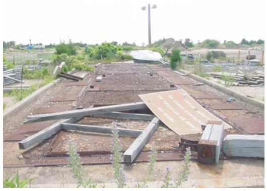
Elevator at Bravo Section, 427, as photographed in 2003.