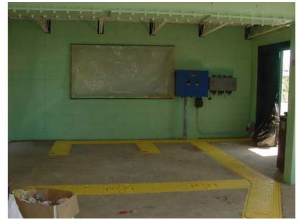
Interior of Generator House 410 during cleanup in 2003.

TH: 410 is listed as the Generator House.