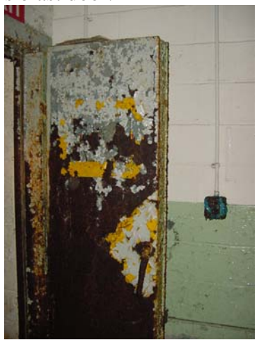
Blast door photographed in 2003.

TH: The closet right behind this blast door.