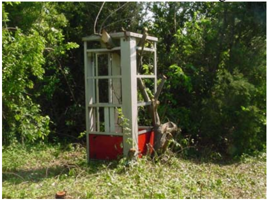
Telephone booth photographed in 2004.

PD: Between 403 and 404 we have the remains of an aluminum telephone booth. All the windows have been smashed out of it. You might write that down on our map just right here. We note that in the telephone booth the telephone says to deposit 10 cents. That might be datable by that information. We are now walking east of 403.