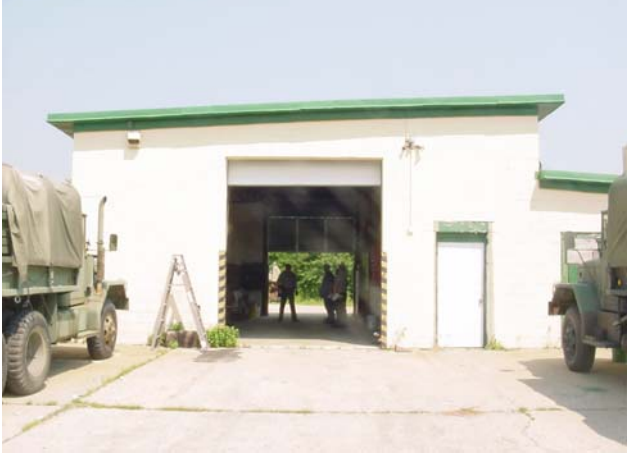
Missile Assembly Building S-449 photographed in 2003.

PD: We are standing in front of building S-449. What was this used to for?