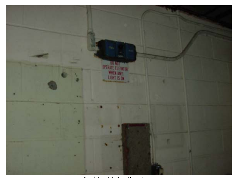
Inside Alpha Section. Sign states "Do Not Operate Elevator When Light is On." Photographed in 2003.