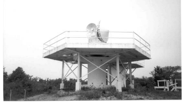
Target tracking Radar Tower in 2003.

PD: We are now at 472 and this looks like another tower. What does that read?