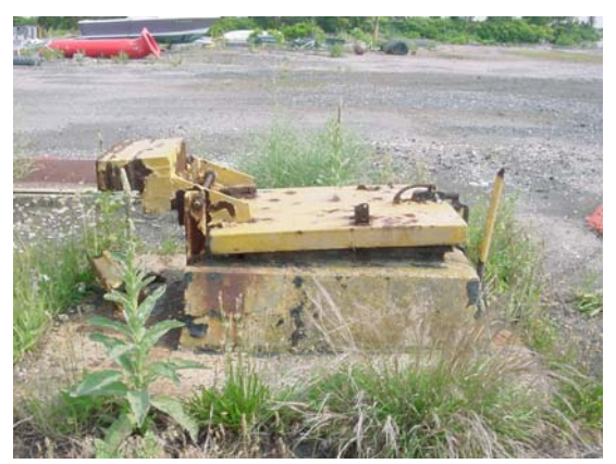
Main Hatch to Alpha Section also know as number 428. Photographed in 2003.

hours on, 24 hours off. 8 hours (on) and 8 hours (off). On your 24 hours on, after you got a few hours sleep you would be here at 5:30, 6:00 in the morning and you had to do daily checks on the missiles to insure the safety of them. And your first thing you would start with would be on this block over here. On this block over here there would be a generator and there would be safety check.