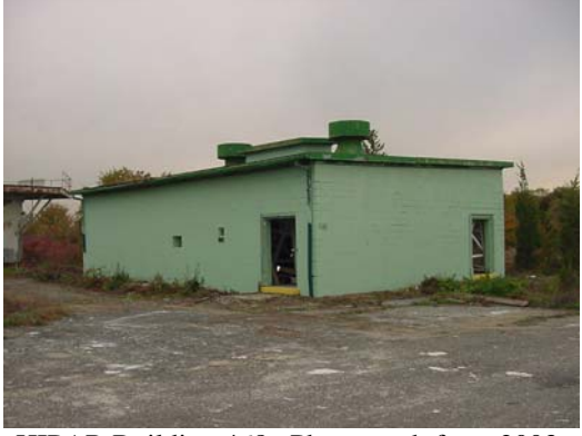
HIPAR Building 468. Photograph from 2003.

TH: 468 is the HIPAR Building. HIPAR radar, the way I understand it was the long range radar that would sweep out over the ocean to make the initial contact with anything flying out there.