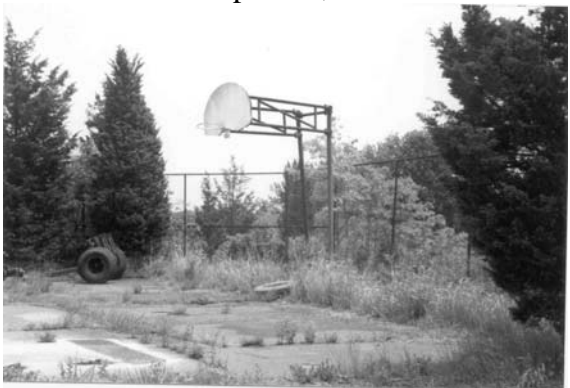
Basketball court as photographed in 2003.

PD: These trailers are stored in a semi surrounded asphalt pad compound that used to be an old basketball court, an open air basketball court. (Information not important.) You can still see the lines for basketball and badminton they used play on this asphalt court. There is even a rusty old basketball net up there, backboard.