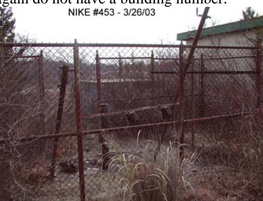
Tranformers next to Building 453.

TH: It had something to do with the transformers. That concrete block structure is 453. The transformers once again do not have a building number.