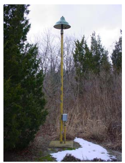
Light pole photographed in 2003.

TH: As an after thought looking at the light stanchions they seem to date from about the same time as the buildings went up here at the radar site which is probably around the late '50s or the lights might have been put in during the 1960s.