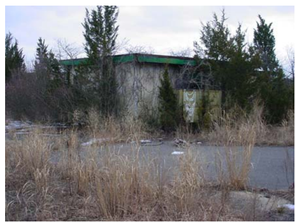
Building 454 as photographed in 2003.