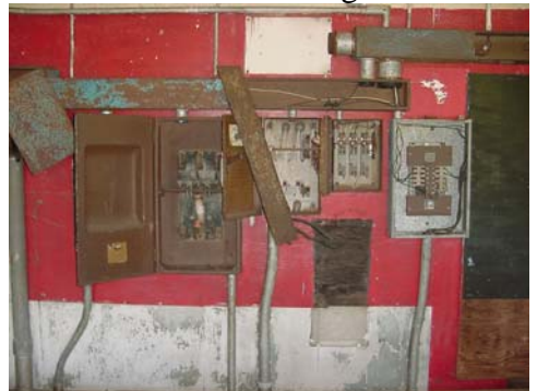
Inside the Generator House 414 as photographed in 2003.

TH: 414 on the master list is a Generator House again.