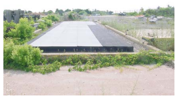
Elevator opening of Alpha Section, 428, photographed in 2003.