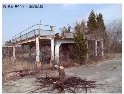
Target Tracking Radar Tower as photographed in 2003.

PD: Alright, the generators have been taken away. The generators are missing. We are moving east and north of 414 toward two, the remains of two concrete based radar towers. The first one we are looking at is 417.