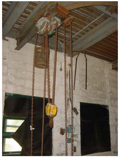
Hoist system inside the Warhead Building S-450 photographed in 2003.

PD: We are now looking at Building S-450 and we are on the west berm surrounding that.