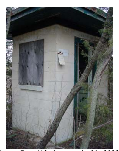
Sentry Box 413 photographed in 2003.

TH: That is Building 413, another Sentry Box right there.