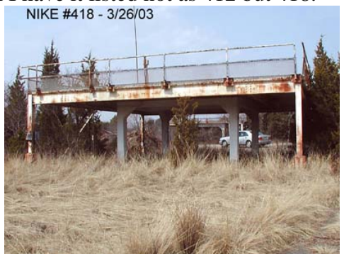
Acquisition Radar Tower photographed in 2003.

PD: According to my plan I have it listed not as 412 but 418.