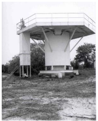
Target Ranging Radar Tower 467 photographed in 2003.