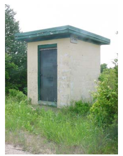
Building 447 as photographed in 2003.

S-447 was basically oil and paint, well mostly grease, okay. There was another paint shack. I don't think it is right here right now. It was destroyed. It was right on the outside.