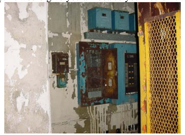
Electrical panel next to elevator as photographed in 2003.

RM: Right here is the panel for the elevator. You had the elevator operator over in this part. Right here would be the safe. There used to be a safe that would have arming devices for the missiles, okay because the missiles weren't armed. They used to have a pin. A little round pin, they had different pins that would fit in symmetrically into the warhead itself and the section chief would check it and there would be one man arming it. The section chief would be right behind him. Meanwhile, they had the elevator which was run off 440 power. So, they used to pull 440. Later, they converted it but I, the Missile Site, it was the 440. This is pretty self explanatory, okay. They had it would be in a locked position and this was the water hose. The ceiling lights, the power lights, the main lights okay. 416, it used to be 440. There is the 440 right there. And you can see the size of the cables we basically dealt with. They were large cables with the head that were a pin index right in there. Basically in the dark so if someone was coming down here and they had a flashlight and were just looking this would be basically about where the missile would stop. It would give you an idea so you wouldn't walk into it.