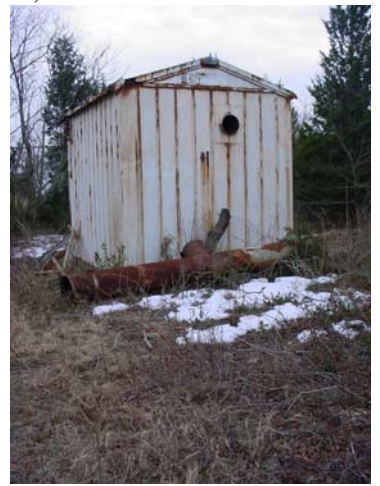
Boiler Room 407 as photographed in 2003.

they have been done by jokers. Now just west of 406 there is another building. It's number is T-407. What was this, Tom?