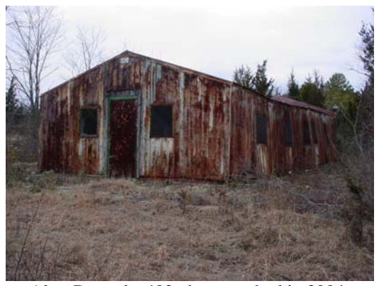
Alert Barracks 402 photographed in 2004.

PD: There appear to be some dark oil stains between the two sides, the two pieces of this truck loading ramp. It is probably a place for car reparations and changing oil in vehicles. There is no number for this truck loading ramp. We are now looking at a small concrete pad that is located between the truck loading ramp and Building T-402. It's just a concrete pad with four bolts sticking out. They are both rusty and an iron pipe. We will have to identify this later. We are now standing in front of 402. It is padlocked. There seems to be a glass grated covering over each window. What do you think this was once used for, Tom?