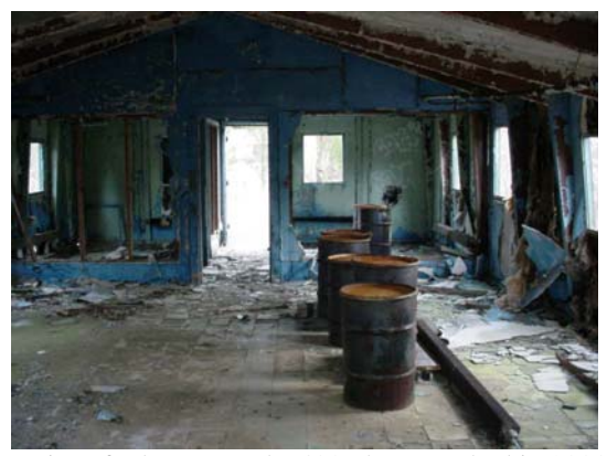
Interior of Alert Barracks 403 photographed in 2003.