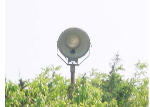
Flood light inside the Launching Area as photographed in 2003.

RM: Two fold purpose. In case it was ever done at night and besides being at night if there was ever an infiltrator they could turn the lights on them and they could find them pretty easy. You notice this is done on the inside. It is mostly for transporting. They wanted to make sure it was safe because say they put it in and all of a sudden a complication had happened, right, they may still want to work on it. You really couldn't leave it in here overnight not without keeping guards on constantly and that will drive a guard up the wall being out here in the cold so you might work on them when you need to pull it out there to keep the lights on. Just as there are lights up in the other section. Now they did have war games also. We played war games here. There would be evaluator would come here and use that as a headquarters or so and we used to play war games like, "Bang. You are dead." A guy would come in and give you a note, Bang you are dead. Things like that. You know the war games were the interesting portion. It was pretty fun.