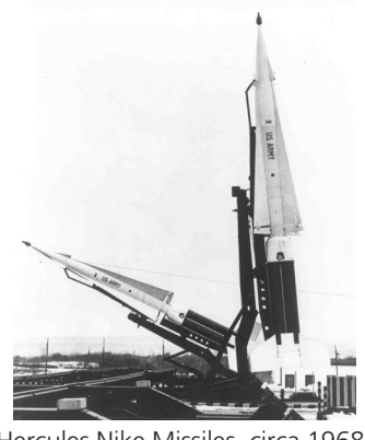
Hercules Nike Missiles, circa 1968

The Korean War kept Fort Hancock active as a staging and supply base for Army anti-aircraft gun battalions located throughout the metropolitan New Jersey-New York area. In 1954, the army started replacing anti-aircraft guns with new Nike Air Defense Missiles.