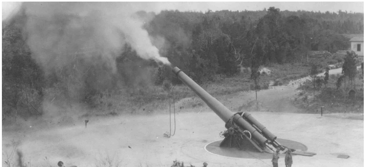
Battery Kingman firing, 1919.

Battery Potter proved too costly to build, and took too long to fire its guns. To reduce costs and improve the efficiency of the disappearing gun concept, counterbalanced gun carriages were developed during the early 1890s. This simple design greatly reduced manufacturing and maintenance costs while increasing a gun's rate of fire. A large counterweight, connected to two pair of steel arms holding a large gun barrel, dropped down and quickly raised the gun up from behind a protective concrete wall. When the gun came up over the wall it was fired. Firing made the gun recoil (kick back) behind the wall and back into its loading position. A well-trained gun crew could fire two rounds a minute from a 10- or 12-inch counterweight mounted gun. From 1896 to 1909, seven counterweight-type disappearing gun batteries, mounting a total of sixteen 6-, 8-, 10-, and 12- inch caliber guns were built at Sandy Hook. These included Battery Granger, and the Nine-gun Battery at North Beach.