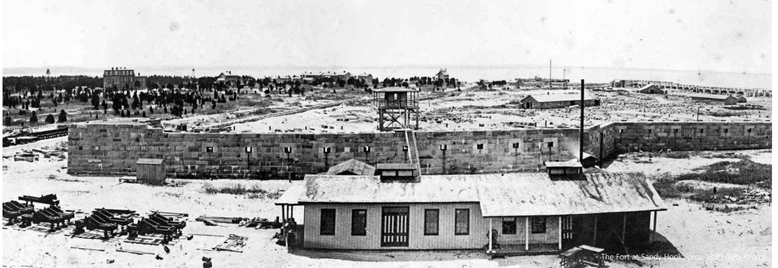
The Fort at Sandy Hook, circa 1880

Sandy Hook's location at the entrance to New York Harbor made it an important site for the defense of New York City. Large enemy warships had to navigate the Sandy Hook Channel to attack the harbor, putting them within cannon range of Sandy Hook. The series of forts built on Sandy Hook from Colonial days to the modern missile era represented the latest defensive systems. Each fort used the newest technological improvements in weapons and construction techniques in their time.