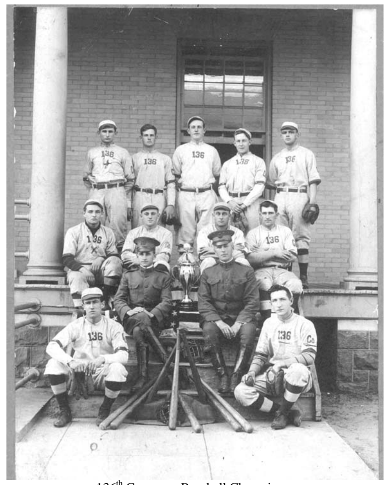
136<sup>th</sup> Company Baseball Champions.