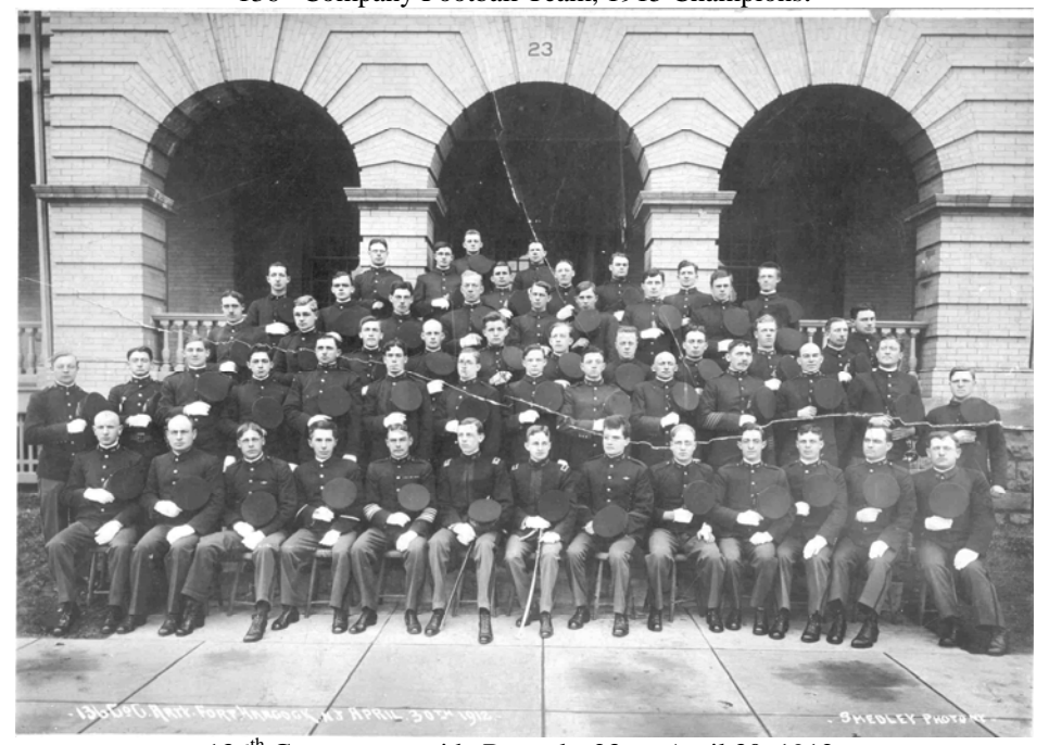
136<sup>th</sup> Company outside Barracks 23 on April 30, 1912.