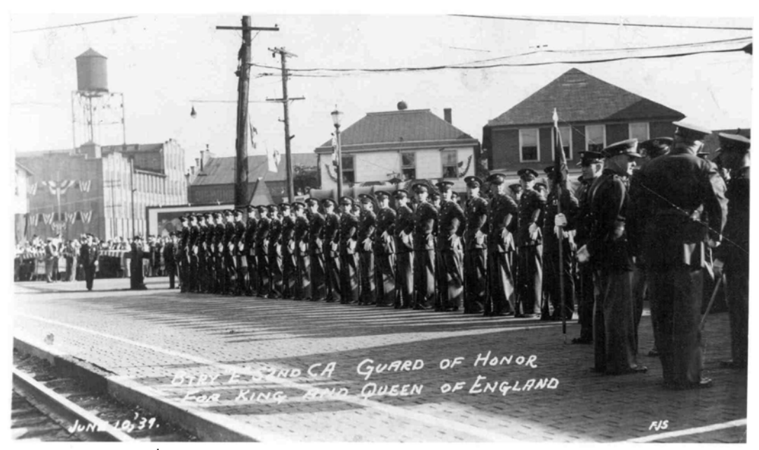
52<sup>nd</sup> Coast Artillery, Battery E "Guard of Honor" in Red Bank, NJ.