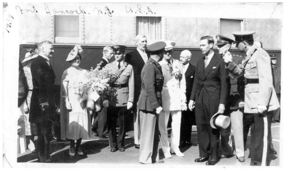
King and Queen meet with dignitaries at Red Bank (NJ) Train Station