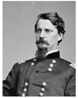
Winfield Scott Hancock

By 1895, U.S. Army engineers at Sandy Hook had finished building two concrete gun batteries designed to defend the entrance to Lower New York Harbor. However, there was no housing available for the several hundred soldiers needed to man them. To rectify the situation, the Secretary of War issued General Order #57 on October 30, 1895 establishing Fort Hancock. The fortifications were named in honor of General Winfield Scott Hancock, a national Civil War hero.