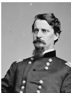
Winfield Scott Hancock

By 1895, U.S. Army engineers at Sandy Hook had finished building two concrete gun batteries designed to defend the entrance to Lower New York Harbor. However, there was no housing available for the several hundred soldiers needed to man them. To rectify the situation, the Secretary of War issued General Order #57 on October 30, 1895 establishing Fort Hancock. The fortifications were named in honor of General Winfield Scott Hancock, a national Civil War hero.