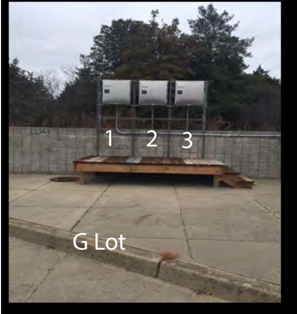
10' x 10' Approx. Spot Location