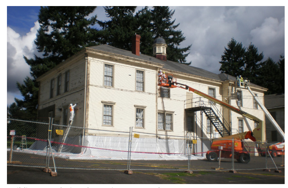
Building 991 during the project, September, 2013