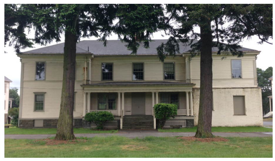
Building 991 prior to rehabilitation

Building 991, which was built in 1906, was selected as the first building for rehabilitation because, of the five large signature buildings within East Vancouver Barracks, it was in the worst condition, with a leaking roof and gutters and extensive water damage. The building is also the smallest of the five, and allowed the National Park Service to test estimating accuracy before moving on to larger projects. At its completion in November 2013, the rehabilitation of Building 991 had come in under-budget and on-schedule!