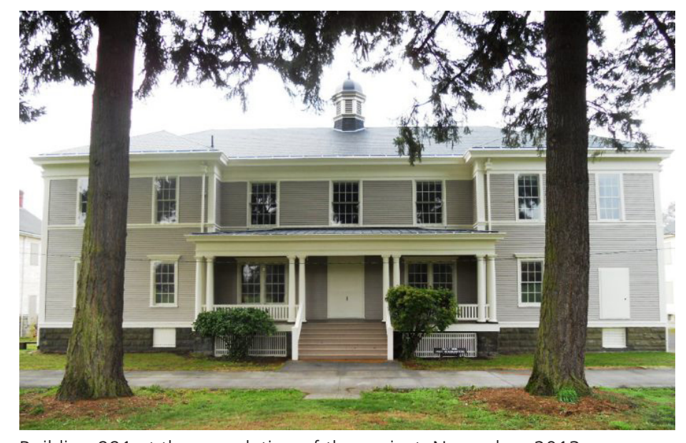
Building 991 at the completion of the project, November, 2013