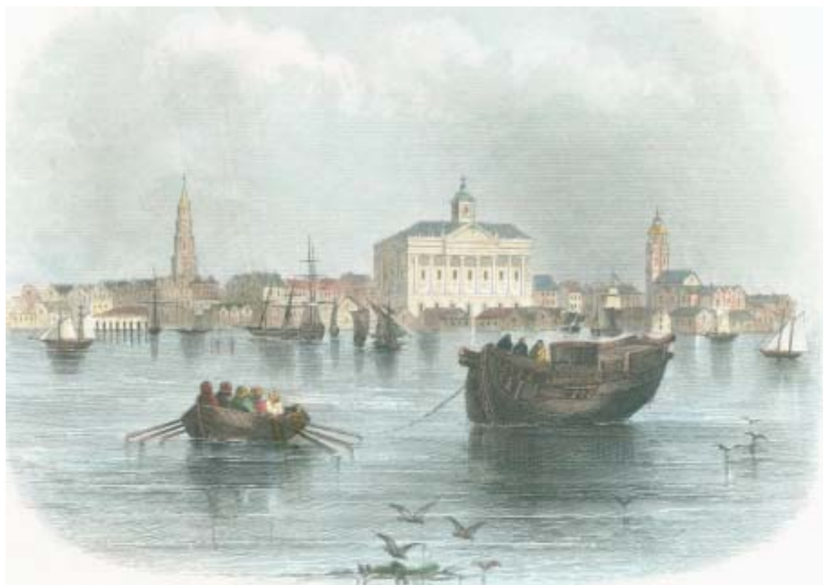
Charleston in 1780 from the Cooper River

of the 2 nd South Carolina Regiment. At the time, there was no official American or South Carolina flag, so Moultrie designed one for his command. The dark blue flag resembled the color of his men's uniform coats, with a white crescent in the top left corner. Moultrie proudly wrote in his memoirs that his flag became a symbol of defiance of the British and the "first American flag . . . displayed in South Carolina."