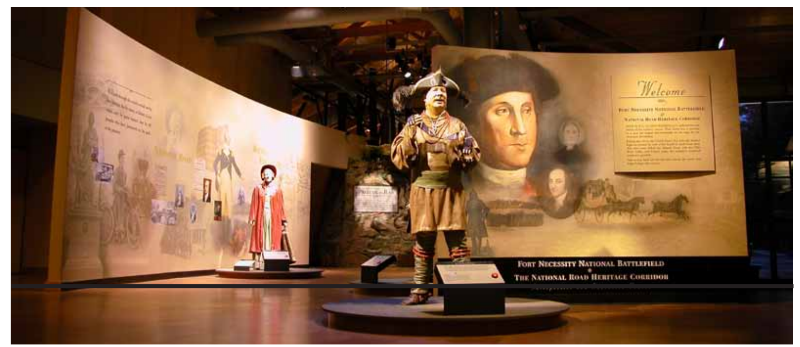
Historic figures welcome visitors to the Fort Necessity/National Road Interpretation and Education Center.

This program was developed to meet the Pennsylvania academic standards for history and geography at the fourth through sixth grade level. While your students are enjoying themselves they are learning things they need to know. Your field trip won't be a day lost from accomplishing your lesson plan.