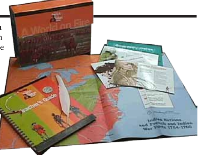
"So pertinent to our studies."

The "French and Indian War: 1754-1763" is a complete teacher's education kit for 4th -6th grade teachers. The kit includes a 156 page teacher's guide, background information for teachers, student readings and numerous activities. It also includes 27 biography cards, a color wall map and three reproduction artifacts. The kit is available for $40.00 through the Fort Necessity bookstore. Two free lessons are accessible on the Fort Necessity web site.