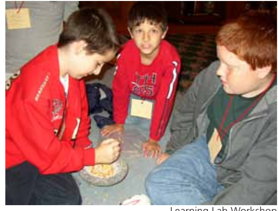
Learning Lab Workshop

the British were vulnerable. They also look at the difficult decision the French had to make and decide how they would have acted.