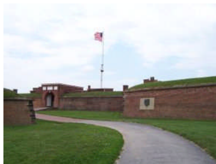
Ft. McHenry Entrance