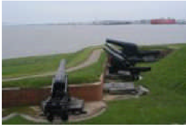
Ft. McHenry Cannons