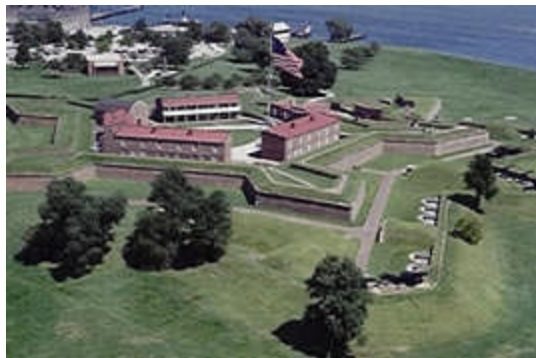
Aerial View of Ft. McHenry