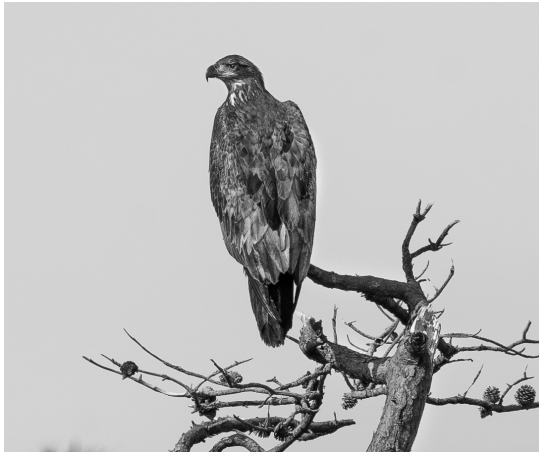
A juvenile Bald Eagle perches on a pine tree in the Otis Pike Wilderness. Birding is a popular activity among hikers. Over 330 species of birds live on or migrate through Fire Island.