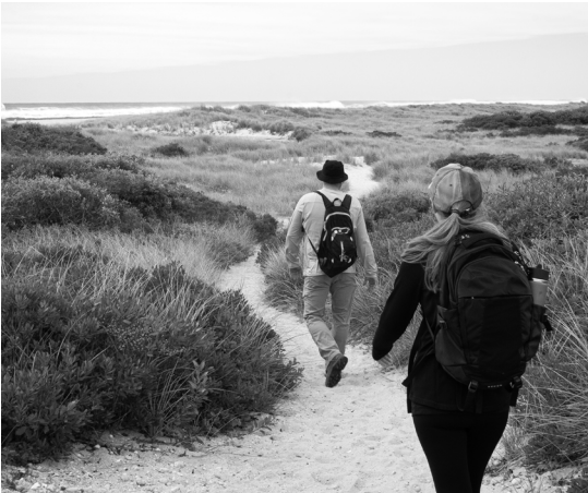
Hikers in the Otis Pike Wilderness walk a sandy trail in the interdunal swale. The Burma Trail provides access to variety of barrier island habitats including the ocean beach, salt marsh, and swale areas.

The Burma Trail allows access to wilderness for hikers, photographers, birders, campers, anglers, hunters, and others. Whether your visit is for a short stroll, a full-day outing, or an overnight trip, read on to learn how to keep this area wild and minimize your impact on this special place.