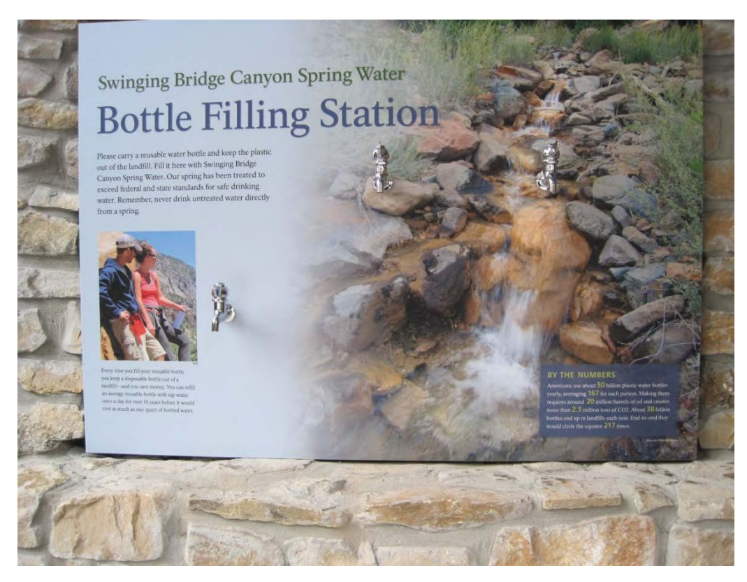
Figure 2 - Completed filling station located in front of TICA visitor contact station at cave trailhead