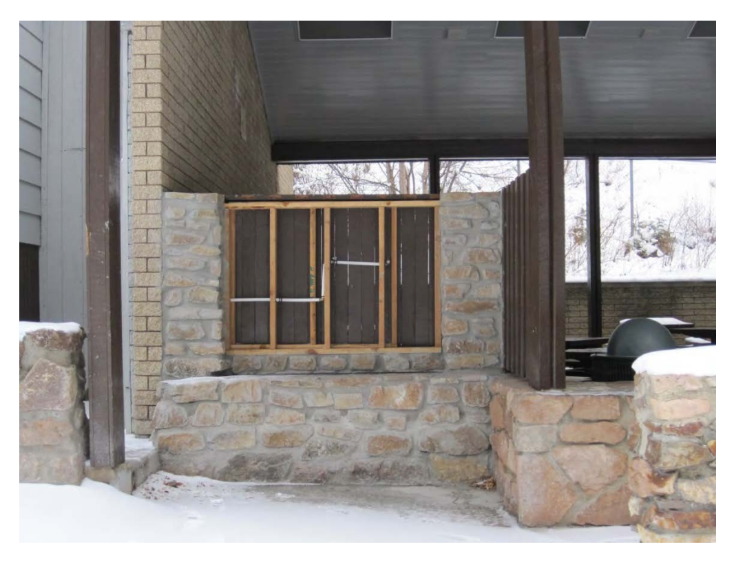
Figure 1 - Filling station under construction. Note proximity of table in adjacent concession food area