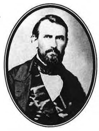
Isaac N. Ebey

Eventually, nearly thirty Ebeys and Crocketts would make the arduous move to Puget Sound between 1851 and 1854, most of them settling on Ebey and Crockett Prairies.