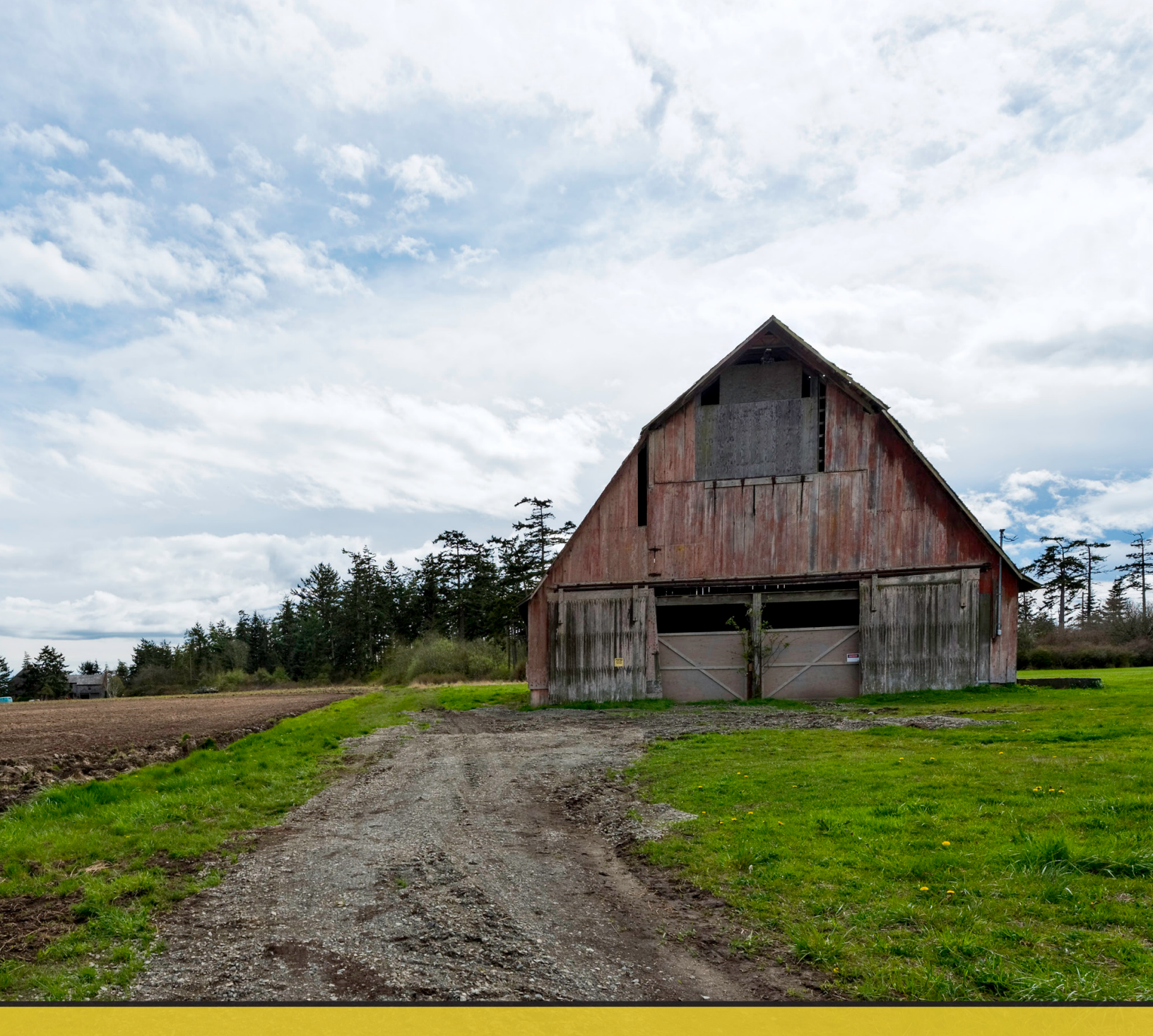
Ebey's Landing National Historical Reserve