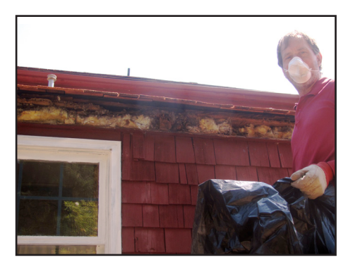
Old County Courthouse - 1855

The Old County Courthouse, now a residence, is the second oldest standing public building in Washington State. Although it was the first building here to incorporate locally milled lumber in its construction, its the only known timberframe house in the Reserve.