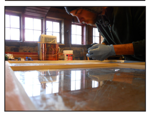
Crockett Barn - 1895

One of the Reserve's iconic structures, the Crockett Barn was built in the mid-1890s by local shipbuilders turned carpenters, the Lovejoy brothers. This large barn has over forty wood window sash of varying design, most of which were in need of restoration work. A 2012 Ebey's Grant helped repair and reglaze nearly all of them. The Crockett Barn is now operated as a rentable event