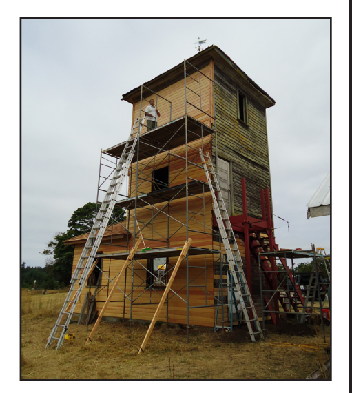
Kineth Farm Watertower - c.1896

One of only two watertowers of this type on Whidbey Island (both in the Reserve), this 2011 grant project replaced deteriorated siding; reshingled shop and tower roofs; rebuilt exterior stairs; repaired windows, doors, and deteriorated trim, and put on a new coat of paint.