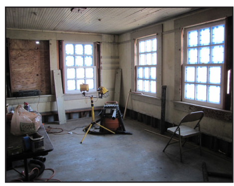
Fort Casey Plotting Room - 1915

Built in 1915, this plotting room was an integral part of Battery Moore's targeting system. It contained the staff and mechanical equipment used to calculate projectile trajectory for the Battery's 10-inch disappearing gun.