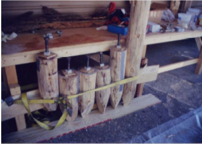
New viga ends after temporary insertion of threaded rods to create threaded mold.