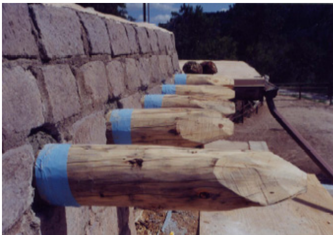
New viga ends threaded in place