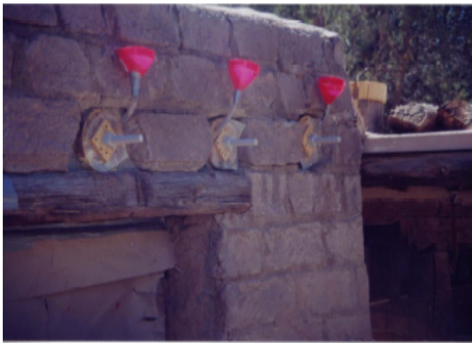
Existing viga ends with temporary epoxy filler tubes and permanent threaded rods installed.