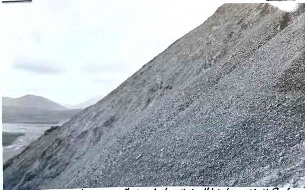
Foot trail on permanent road location. High Line, McK. P. July 1930

Figure 1. Malcolm Elliott High Line Photos (RG79, Box 379, Central Classified Files, 1907-1949, Roads Budget, NARA College Park)