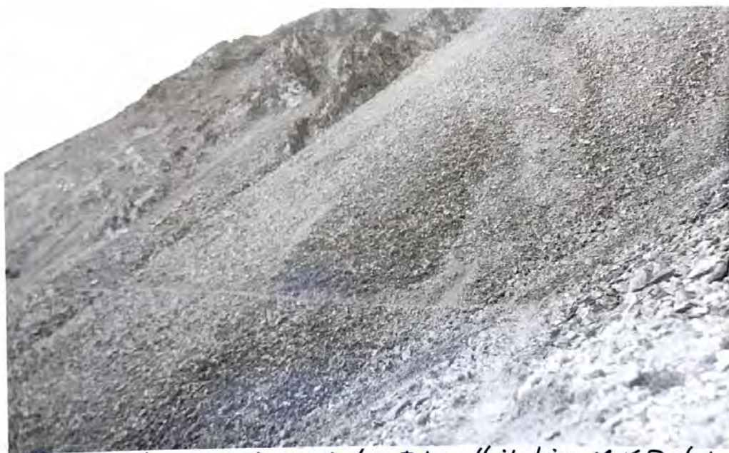
Foot trail on permanent road location. High Line, McK. P. July 1930

Figure 1. Malcolm Elliott High Line Photos (RG79, Box 379, Central Classified Files, 1907-1949, Roads Budget, NARA College Park)