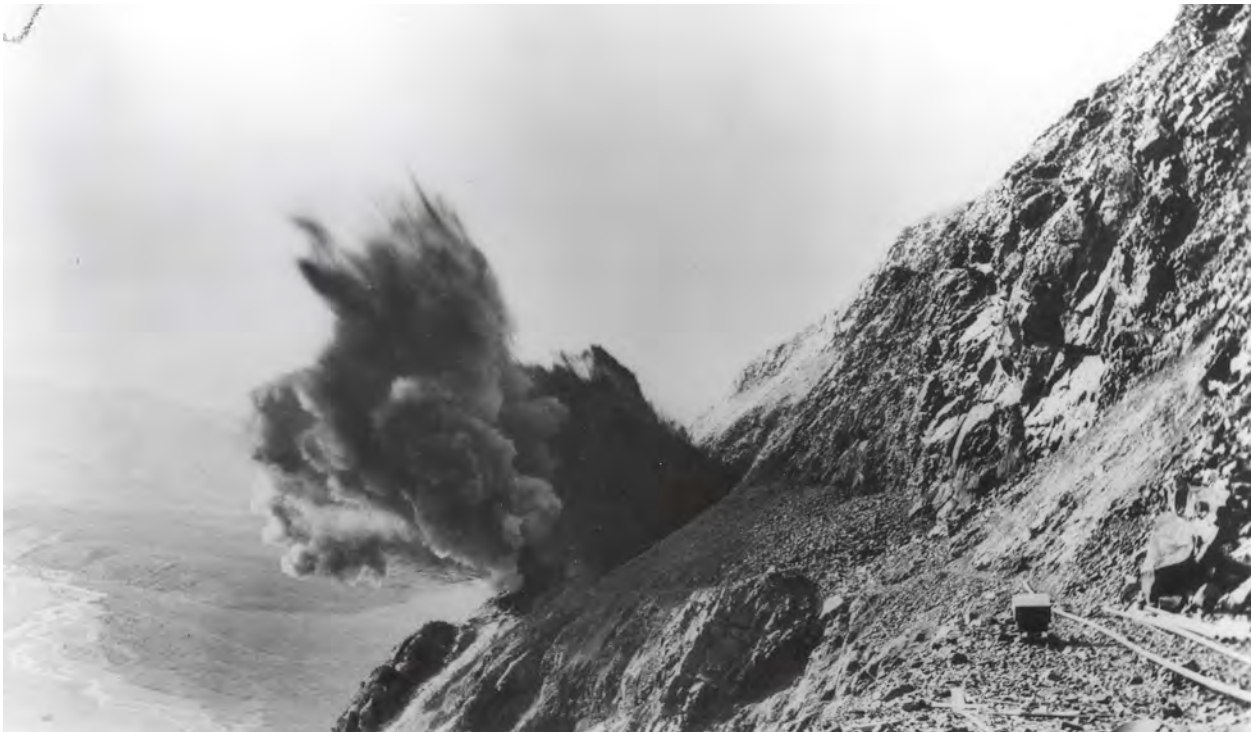
Blasting the High Line route.