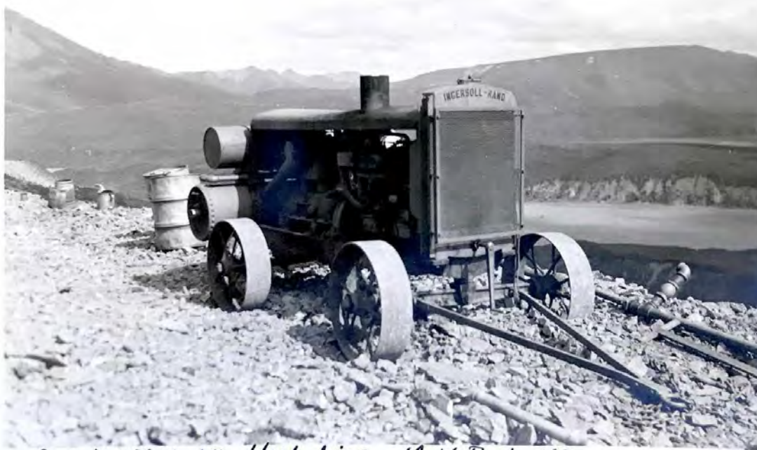
Compressor on High Line, McK. Park, 1930

Figure 7. Malcolm Elliott High Line Photos (RG79, Box 379, Central Classified Files, 1907-1949, Roads Budget, NARA College Park)