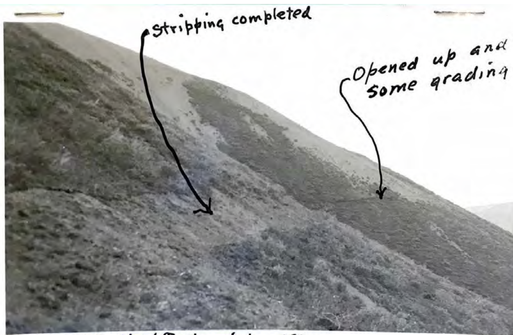
High Line, McK. Park July 1930