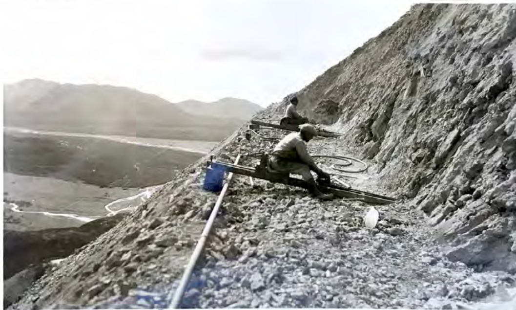
High Line, McK. Park, July, 1930. Drilling