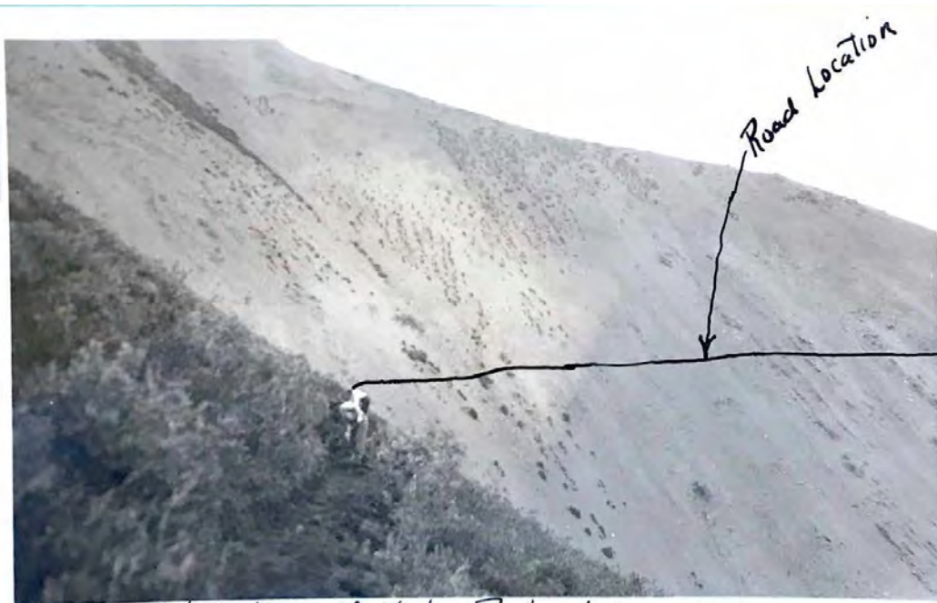
High Line, McKinley Park, July 1930