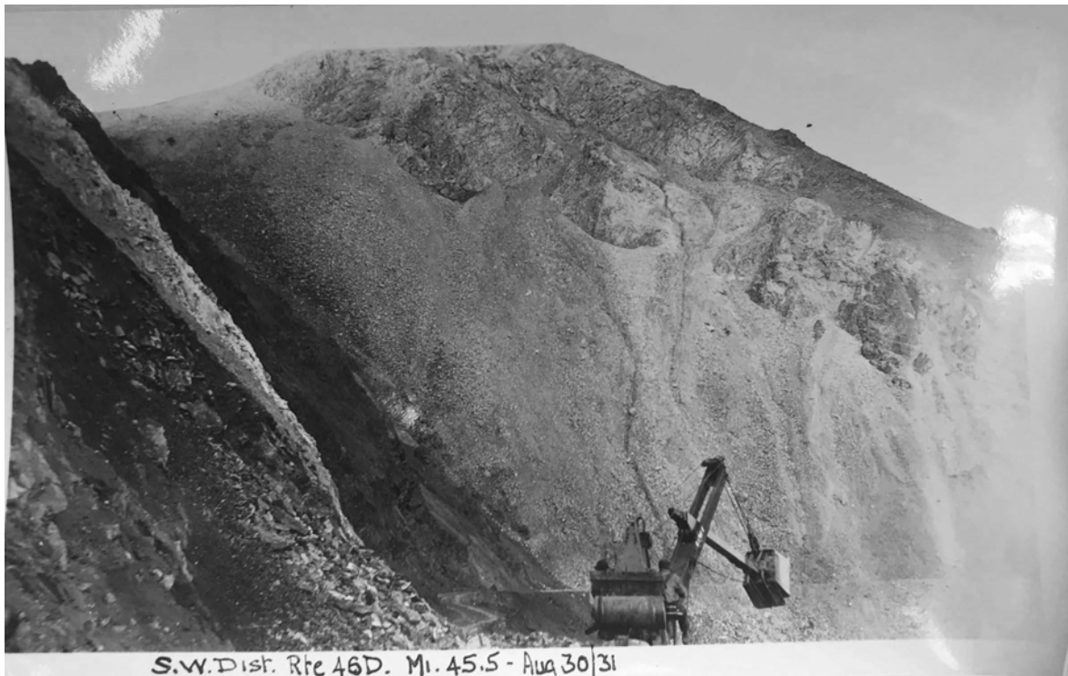
High Line Road being built in 1931

The 1931 NPS Report of the Director proudly described the new section of the road that was completed that summer, “The new Polychrome Pass section was opened late in August, and is one of the great sections of national park highway. Built to all modern standards, except in width, this stretch of road affords a spectacular outlook over Polychrome Pass, the Alaska Range, and the branches of the Toklat River.” 14