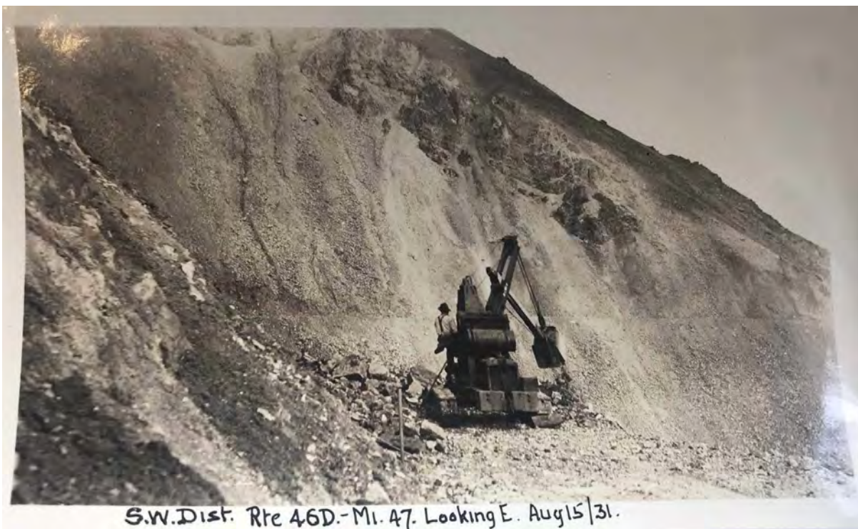
High Line Road being built in 1931 (Edmunds Collection, Box 1, Anchorage Museum)