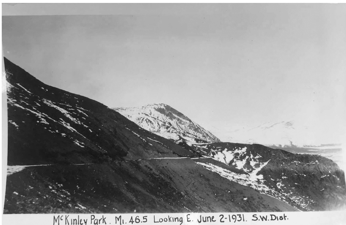
High Line Road being built in 1931 (Edmunds Collection, Box 1, Anchorage Museum)