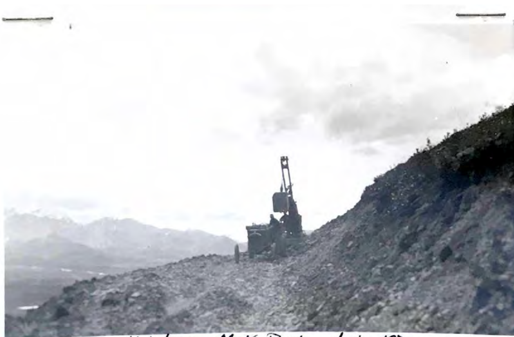
Grading High Line McK. Park July 1930