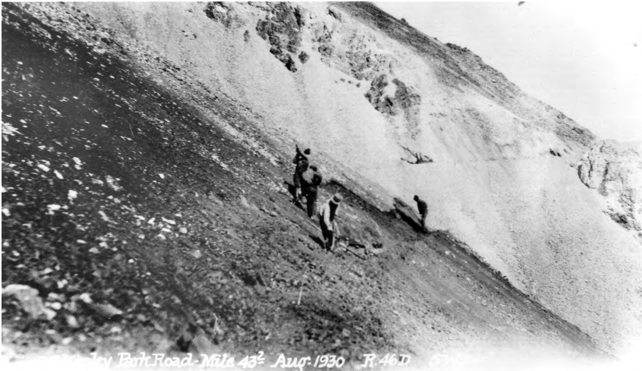
Building the High Line route