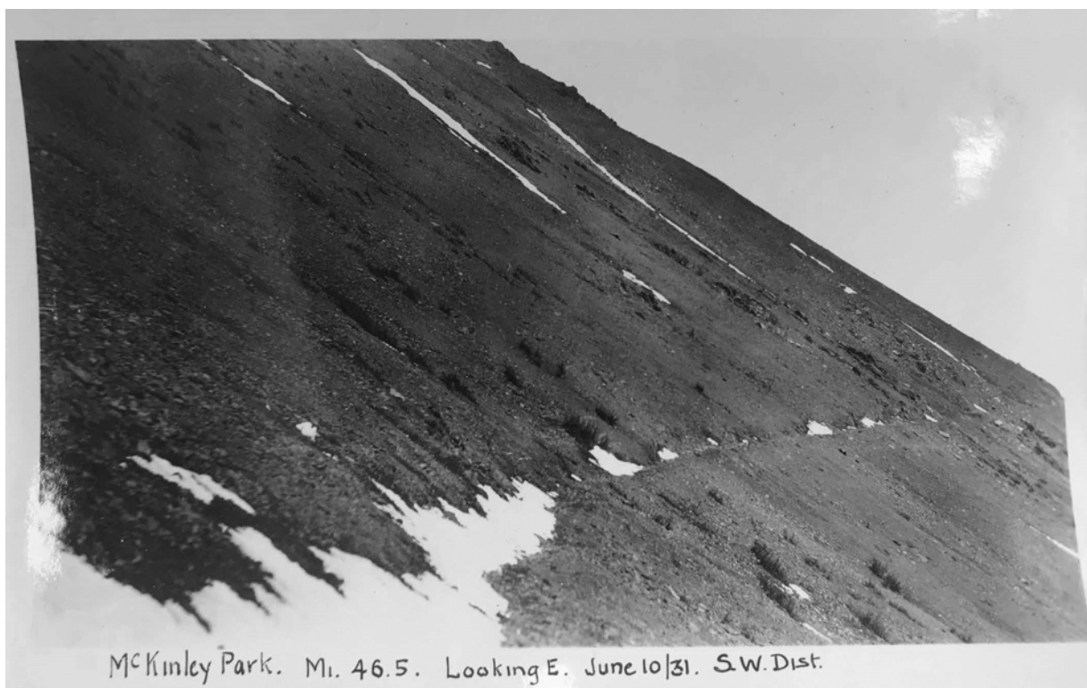
High Line Road being built in 1931