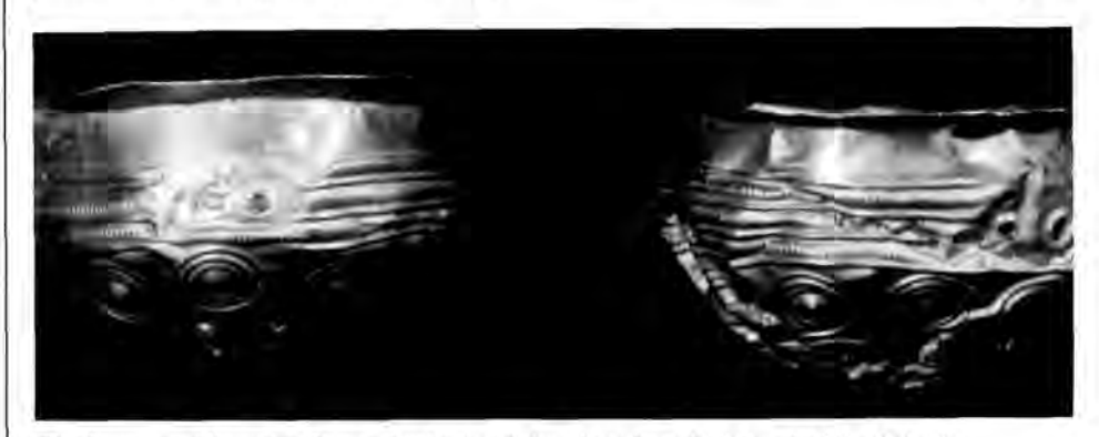
The discovery of these two Bronze Age bowls led directly to the establishment of the Haderslev Museum. They date from ca. 900 B.C.