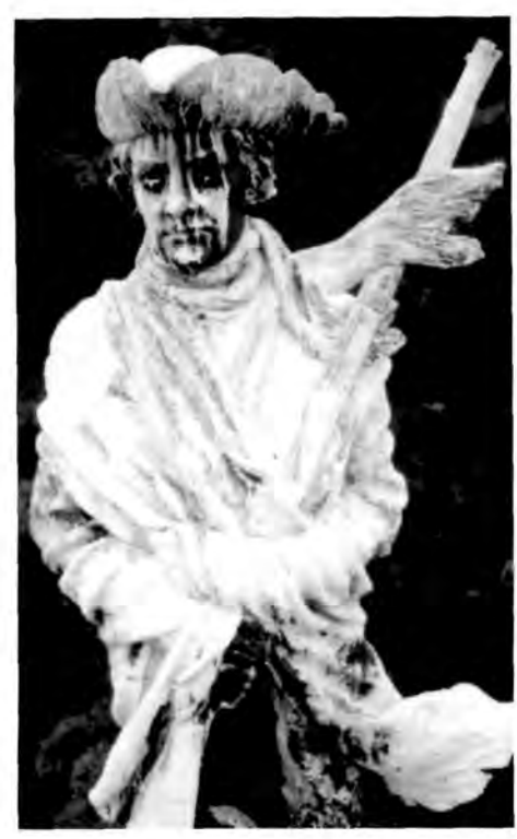
Bronze figure atop New Jersey Monument. Light areas are corrosion products.