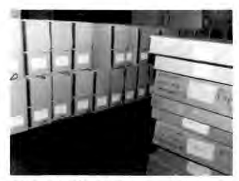
The recently indexed Cook papers collection as it looks today in acid-free document boxes.

collection came to Scotts Bluff National Monument, whose superintendent also oversees Agate Fossil Beds National Monument; 121 document boxes are temporarily stored in the park's library. The National Park Service also received a report prepared by the University of South Dakota containing biographical sketches of Cook family members, a document inventory, a topical index of correspondence, and an assessment of the collection's significance.