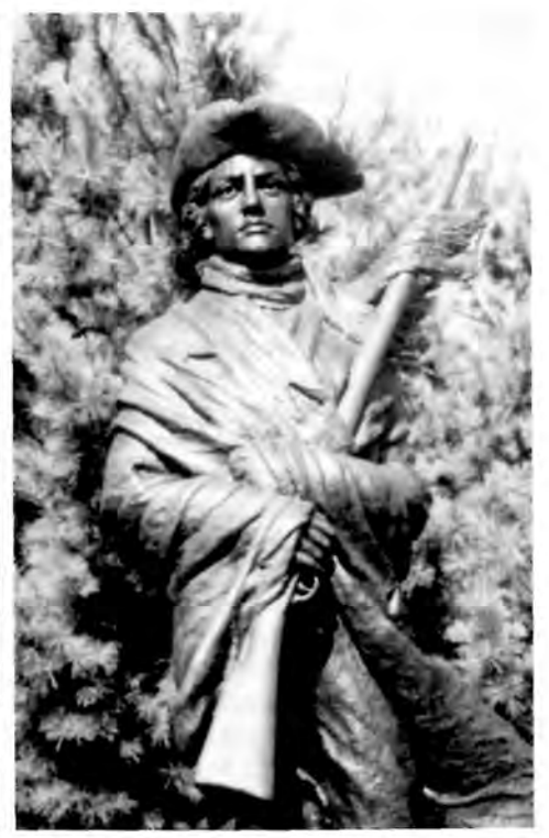
Bronze figure atop New Jersey Monument after treatment.