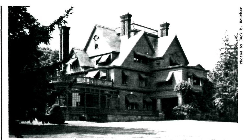
Awnings, trees, vines, and grass shade and reflect summer heat from Thomas A. Edison's home, "Glemmont." In many cases, a building is energy efficient if it is allowed to function in a historic manner without the addition of modern mechanical equipment.

DON'T FORGET TO PROPERLY VENTI-LATE YOUR WORK AREA. THOSE FUMES FROM THE BURNING PAINT CAN BE DANGEROUS!