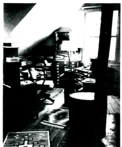
This wood burning stove was used by Carl Sandburg for auxiliary heat in his studio. Its use today would create problems of excessive hydrocarbons, dry heat, and fire hasard. The stove, itself a historic object, would be "used up" if fired.

Controlling heat loss includes elimination of infiltration from the outside by caulking and weather stripping doors and windows, and by blocking openings in walls and ceilings such as light fixtures and convenience outlet boxes. (Some air is necessary for a combustion makeup in furnace rooms or where fireplaces are used.) Ventilating systems should be monitored and controlled for optimum intake of fresh air, and the opening and closing of windows and doors should be regulated during the heating and cooling operation. If these changes are done with care, there will probably be little change in the historic appearance or condition of the building.