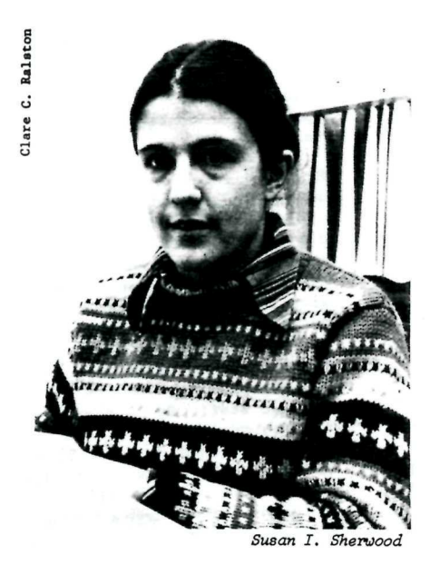
THE THE LIST OF CLASSIFIED STRUCTURES