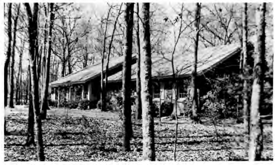
Residence of Jimmy and Rosalynn Carter.

Our strategy was to have a low NPS presence during the interviews and above average familiarity with the equipment that would be used. We wanted to capture the interview in as much a natural state as possible. The reel-to reel tape recorder and operator would be placed out of view