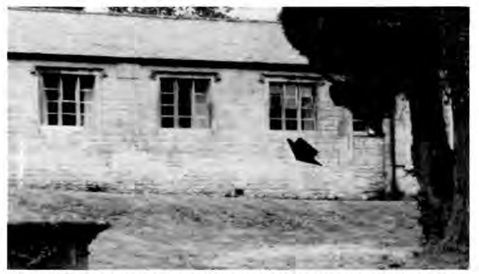
Photo 1. Rising damp is seen along building foundations as a tidemark three or four feet above grade. This tidemark differentiates the wet from the dry area of the foundation wall. Rising damp is generally found in low lying or moist areas.

a noticeable horizontal line demarcating wet from dry masonry, often accompanied by spalling;