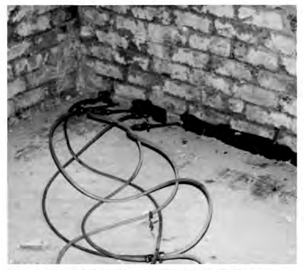
Photo 3. Chemically injected resins can also form a dampcourse layer in some buildings. Holes are drilled approximately every five inches along a masonry joint line or horizontally in the brick. In this case, the dampcourse is installed just above a slab-on-grade floor. The chemicals are injected under pressure, saturate the masonry and upon curing form a barrier to the rising damp.

The treatment of serious rising damp in historic buildings requires thorough evaluation and testing in