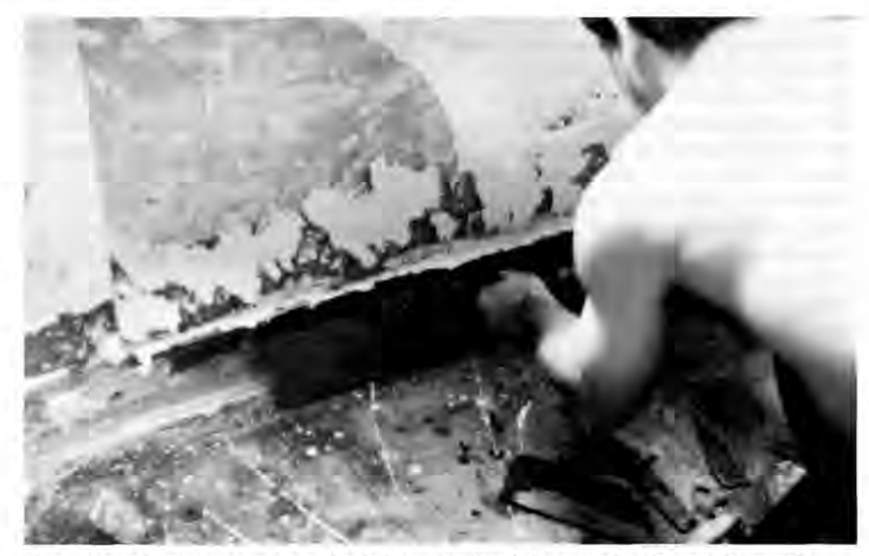
Photo 2. New dampcourses can be mechanically cut into foundation walls. In this regularly coursed brick wall, a heavy polyethylene sheeting is being installed in a slot that has been cut with a tungsten carbide saw. Slate shims and non-shrink mortar are used to hold the sheeting in place.

The basic goal for treating serious rising damp is to stop the upward migration of moisture within the wall. This traditionally was achieved with the installation of a water-impermeable layer of slate or lead between a masonry joint just above the grade level. Because rising damp generally is a result of either no