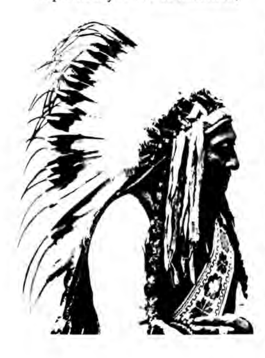
Sioux Chief Sitting Bull

Given the primary role of the National Register, the principal responsibility of the 11 historians,