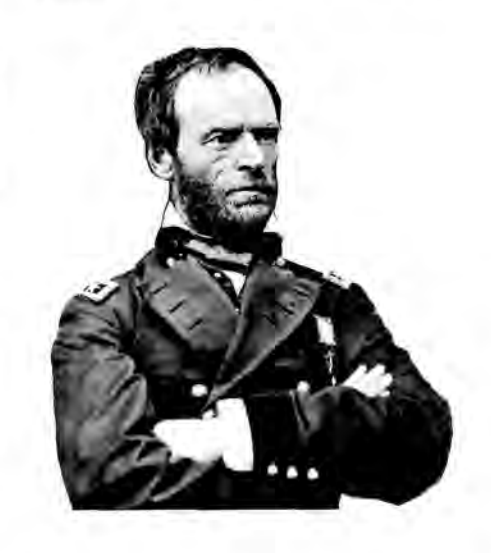
Gen. William T. Sherman

Now that we no longer review every nomination we receive, one of the ways that the National Register staff helps protect the quality of the national program is by participating in periodic evaluations of state preservation programs. One of my on-going special projects has been to assist in the formulation of procedures used to evaluate portions of the state programs relating to surveys and National Register activities, and also to develop and refine procedures for conducting nominations audits used in each of these evaluations. When these program evaluations occur every few years, each reviewer, including myself, participates in the ones for the states with which we work.