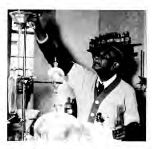
George Washington Carver

proposed action and its anticipated effects, documents previous ACHP review of the proposal, and states any actions proposed to mitigate any adverse effects of the proposal. I work with park staffs to ensure that no actions are undertaken without prior approval of XXX forms, and coordinate the review of the forms by regional cultural resources professionals. I also serve as liaison with the SHPO and ACHP to provide information they need for Section 106 consultations.