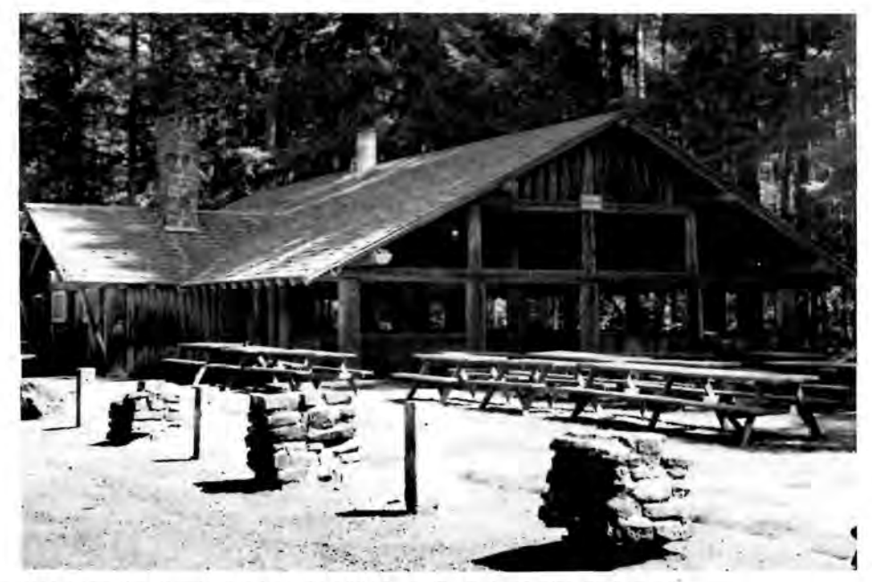
Central Shelter, Lewisville Park, Washington.

In 1974, the Housing and Community Development Act made local surveys of historic resources eligible for funding under Community Development Block Grants, dramatically increasing the funding available for local surveys. In response, the National Register published Guidelines for Local