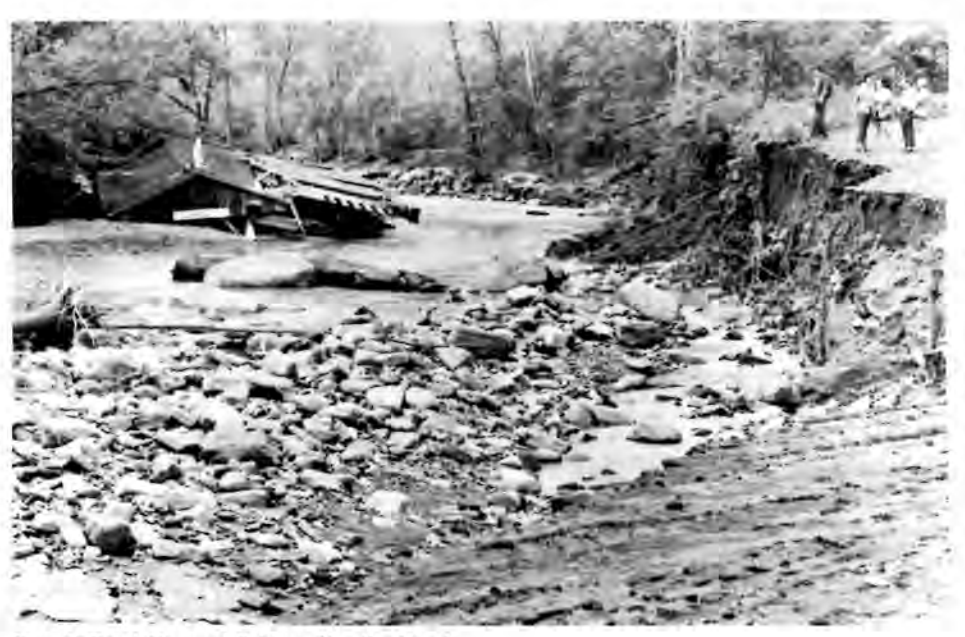
Everett Road Covered Bridge after the flood.