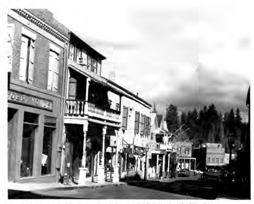
Downtown historic district (200 block of Commercial Street), Nevada City, CA.

The 1980 Amendments also better defined the role of the Department of the Interior in setting standards and guidelines to be used by all participants in the national program. The National Register staff has increasingly focused its attention more on oversight of State historic preservation programs, which must carry out their work in accordance with the Secretary of the Interior's Standards and Guidelines for Identification, Evaluation, and Registration, than on decisions about individual nominations. The National Register staff now also provides more direct