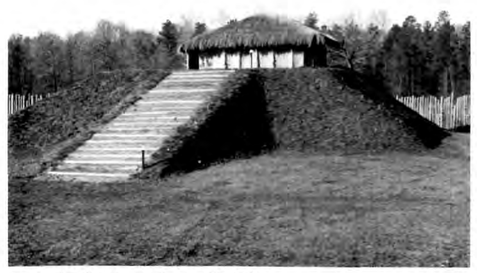
Town Creek Indian Mound, NHL, Mt. Gilead, NC.

In 1966, the National Register included 868 National Historic Landmarks and historic units of the National Park System. In 1987, over 47,000 properties are listed in the National Register, with about 9,000