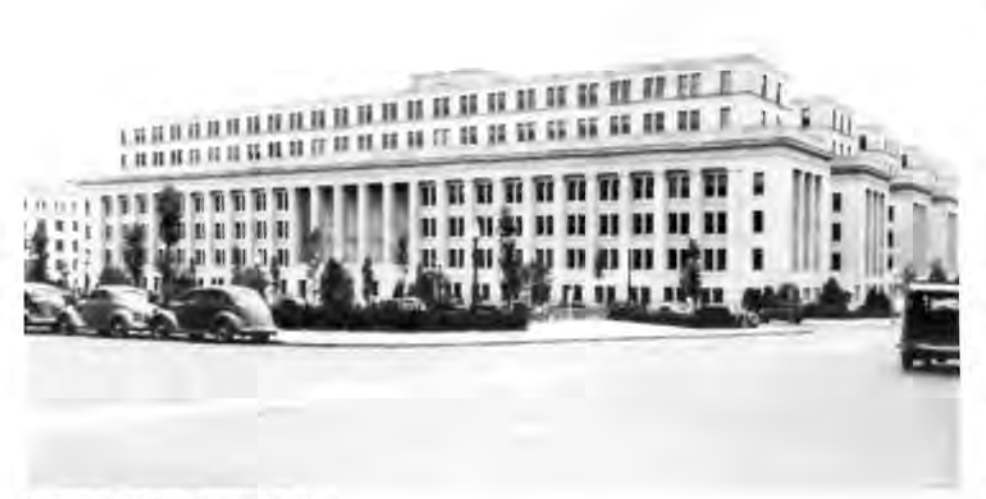
U.S. Department of the Interior.

Through a series of illustrated examples, this publication suggests ways that attached new additions can successfully serve contemporary uses as part of rehabilitation work while preserving significant historic materials and the building's historic character. This guidance should be particularly useful for anyone planning rehabilitation work on a certified historic structure because it discusses new additions exclusively within the framework of the Department of Interior's Standards for Rehabilitation.