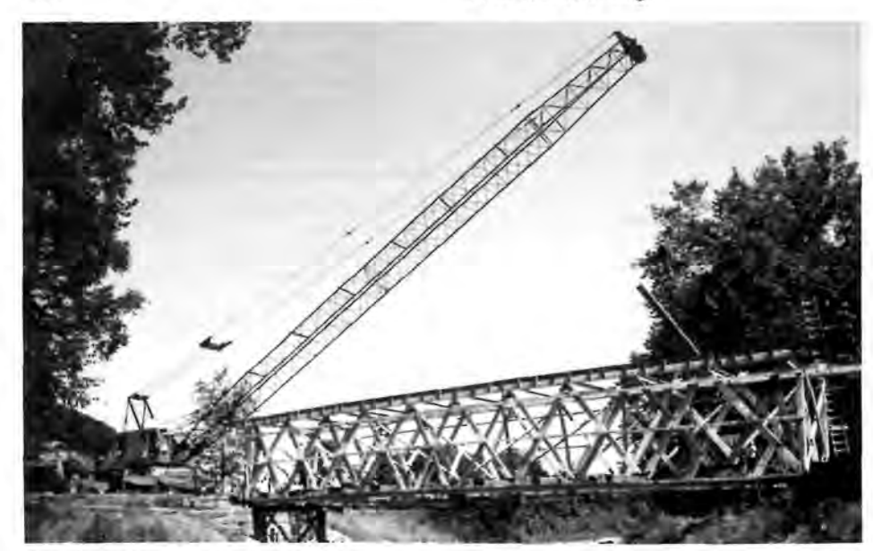
Crane lowering second truss in place.