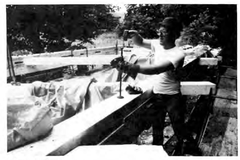
Bolting together bridge.

The bridge is 100 feet long, 18 feet wide, and 19 feet high, with a wood shingle roof which is painted red, its original color. It is open only to non-vehicular traffic to prolong its life and make its recreational use safer for hikers, bicyclists, skiers, and horseback riders.