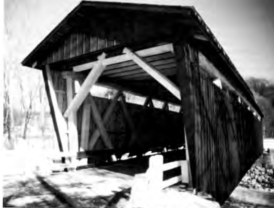
Everett Road Covered Bridge after restoration and dedication in 1986.

The Everett Road Covered Bridge is one of the hundreds of significant structures which the National Park Service was mandated by Congress to protect as part of the cultural landscape in Cuyahoga Valley National Recreation Area (CVNRA). The near-total destruction of the bridge in May 1975 presented the new park (created only the previous December) with a great challenge. With the bridge's restoration in 1986, the challenge was met. The story is symbolic of how this unique urban park was created and continues to develop and prosper today-a story of involvement by local citizens and cooperative action by institutions and governmental agencies at many levels.