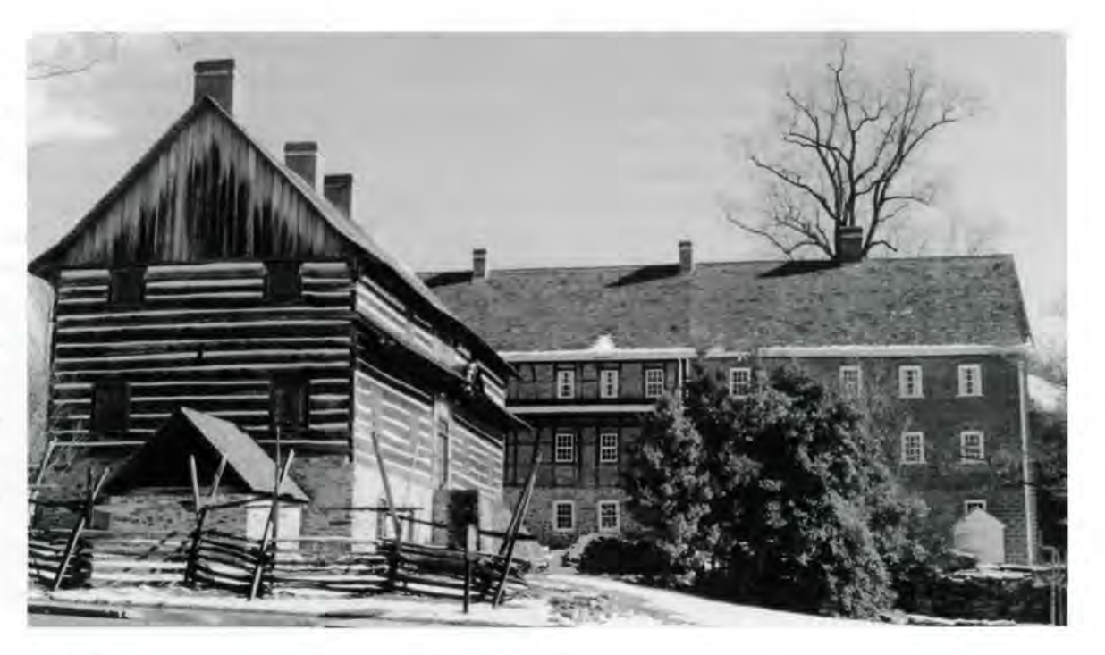
Rear view of the Single Brothers House (1768), located in the Old Salem Historic District (Winston-Salem, North Carolina). The Single Brothers House, a National Historic Landmark, was originally used as a trade school for Moravian boys and as a dormitory for craftsmen and apprentices. Today, it holds the administrative offices of Old Salem Incorporated.

The Moravians' communal approach to living was based on the social concept of Oeconomy , whereby the church elders planned economic development within the Moravian-founded towns. The Brethren were utopian in their beliefs, but were also practical in their everyday lives as their church and its programs were supported by sale of Moravian-produced goods to