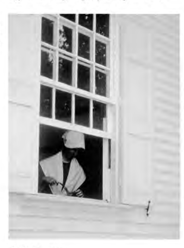
Costumed interpreter in window of 1820 Meeting House.

Work began to bring Pleasant Hill back to its 19th-century appearance. All utilities were buried, walks were repaired or replaced, and original paint colors were discerned and duplicated. In 1965, U.S. Highway 68, which then ran through the center of the village, was re-routed to bypass the village. A group of carpenters was