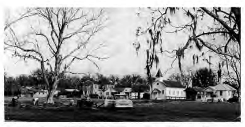
Fazendeville. showing Battleground Baptist Church and homes, 1960.

Parish, Louisiana, where the Battle of New Orleans had been fought in 1815. Fazendeville exemplified the early reconstruction period African-American communities that sprang up after the Civil War. The land was listed in 1854 as part of the succession of Jean Pierre Fazende, a free man of color,<sup>3</sup> who passed it on to his son. After the Civil War, c.1867, the younger Jean Pierre Fazende began to sell lots to former slaves. The residential community of African Americans known as Fazendeville started to grow. <sup>4</sup>