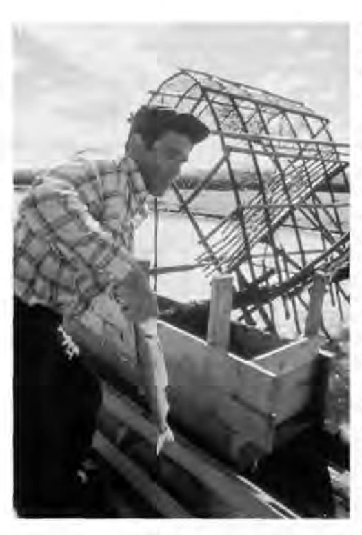
Fishwheel on the Yukon Charley River, Interior Alaska,

geographic area be identified as having C&T subsistence use of an individual resource; for example, brown bear, or resource category, such as all fresh water fish. A positive finding gives residents of the community a status as federally-qualified rural subsistence users. Typically, the analysis emphasizes past and present harvest levels and use areas, but also includes a range of ethnographic data as part of the factors used to evaluate eligi-