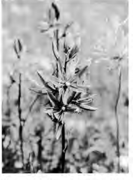
Camas (Camassia quamash) was an important root food for the K'tunaxa and Pilkani. The bulbs were collected in large quantities and cooked in large, stone-lined ovens.

be a return of some selected areas in a landscape to a condition approximating what they were in at the time some parks were established—at least from the standpoint of selective plant productivity and condition. This would amount to a historical reconstruction of landscape elements that more closely reflects the condition of the land and resources when non-Indian peoples first arrived. If such limited experiments were successful, the concept of "cultural landscape" would be expanded to recognize the resource-managing skills of Indian peoples. For the natural scientist, experiments that reveal the effect of plant horticultural and collection techniques on the range, morphology, and productivity of native plants should also be of great importance. If such experiments are conducted, they can be allowed under a scientific permitting system, thereby avoiding