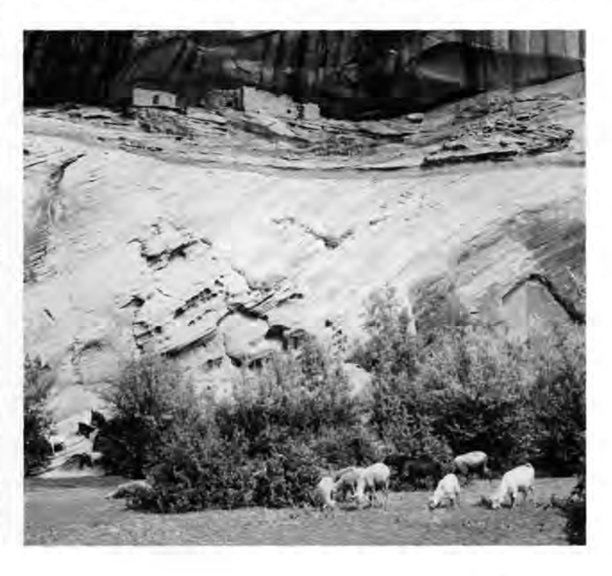
Navajo sheep grazing near Junction ruins, the cliff masonry construction by earlier American Indian people at Canyon de Chelly, Arizona.

We noticed another interesting pattern. The canyon residents we interviewed, not surprisingly, emphasized places within their own customary use areas. More surprisingly, they told different stories about widely-known sacred places in those areas than non-residents told about those same places. The non-residents referred to stories known all over Navajoland about the origin of particular Navajo ceremonies, beliefs, and customs. They referred specifically to the episodes of these stories that occurred at particular places in the canyon. The residents told about encounters between family members and immortal personages ("Holy People") or unusual manifestations of power that go with these places according to the widely known origin stories. The residents' stories linked the family through personal experi-