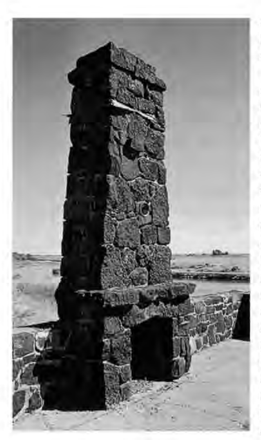
Chimney in waiting room of entry building.

ated in the 950-acre heart of the 33,000-acre reserve.