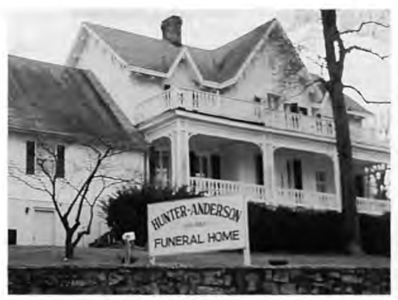
Hunter-Anderson Funeral Home, Berkley Springs, West Virginia.

Lutheran church as one of its funeral homes. A number of funeral home web pages present detailed histories of the former residence and its owners. Typically the cyber narrative offers insights to the rationale for using a large vintage residence as a funeral parlor. One history stated: "This lovely old home also helped to do away with the old stereotype of the 'funeral parlor' that was so common in those days. The new location would prove to be one of a warm and friendly atmosphere." <sup>2</sup>