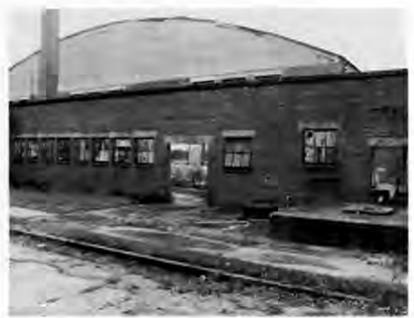
Left, hanger #1 at Moton Field during World War II. Right, hanger #1 at Moton Field in 1997.

For more information contact: Tuskegee Airmen Study, National Park Service, Southeast Regional Office, Atlanta Federal Center—1924 Building, 100 Alabama Street SW, Atlanta, GA 30303.