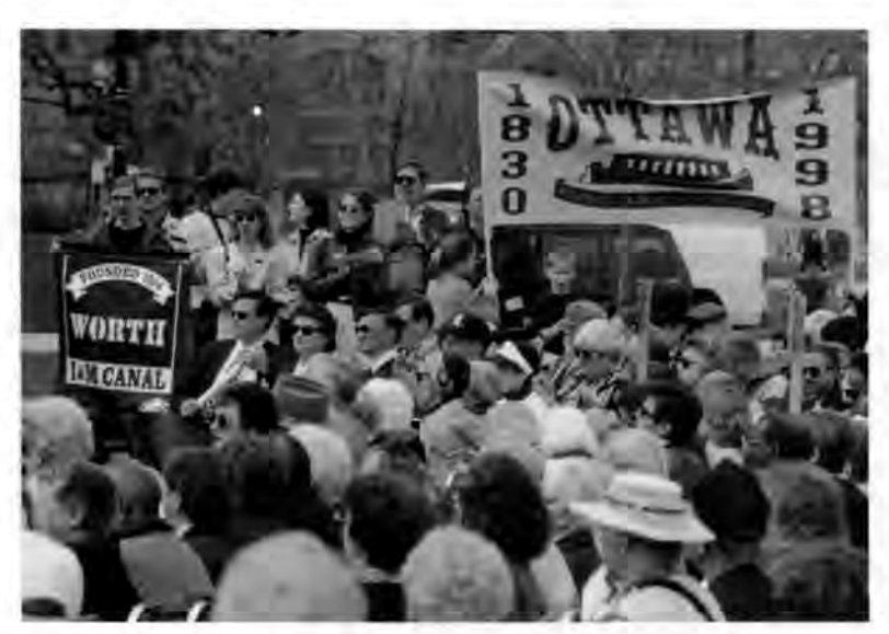
Part of the crowd at the April 18, 1998, Illinois and Michigan Canal "birthday party."

In 1994, the commission formed a committee including representatives from Corridor Commission partners, both public and private, and from citizen boosters, to plan the commemoration. Everyone hoped that the 49 Corridor communities would produce their own sesquicentennial events. Such celebrations could bring needed capital improvements, tourism dollars, and a renewed interest in the importance of the I&M Canal to the region.