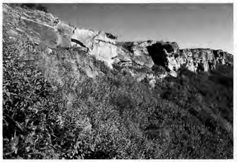
Not all World Heritage Sites in Canada are managed by Parks Canada; Head-Smashed-In Bison Jump is managed by the Province of Alberta.