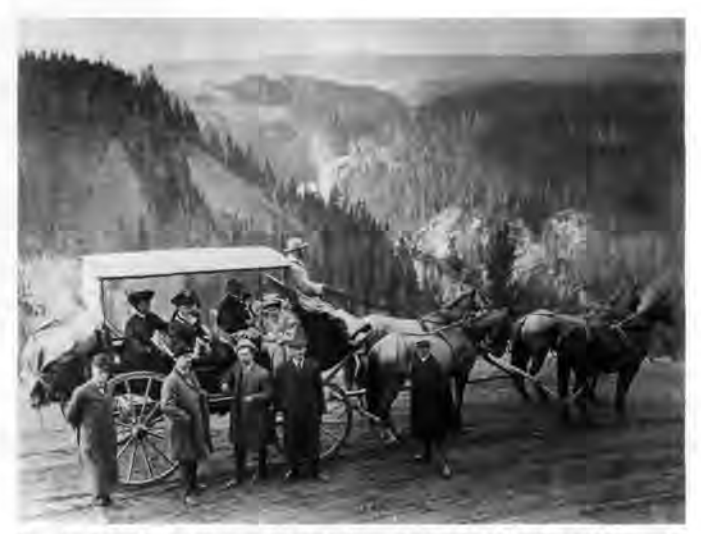
Four-horse coaching party on the road above the Upper Falls, Grand Canyon of the Yellowstone, early 1900s.

each group having to be self-sufficient throughout their tour. After the late 1870s, transportation routes constructed to and through the park provided ever greater access to Yellowstone. This increase in access escalated the number of tourists from distant areas. Socioeconomic conditions of the time were such that the composition of this population was largely restricted to the upper-middle and upper classes. Consequently, tourist accommodations improved rapidly with the addition of several luxury hotels to meet