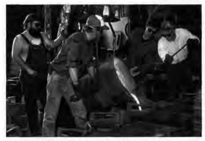
Casting iron, Knight Foundry.

ridge above Sutter Creek. The Tanner Reservoir which supplies water to Knight Foundry was built in the late 1870s as part of the Amador Canal to supply water power to the mines of central Amador County. The Amador Canal, through a system of wooden flumes, ditches and man-made lakes, carried water over 50 miles from the Mokelumne River to ensure a dependable year round power supply. Apart from the main water wheel, small wheels throughout the site operate other pieces of machinery. A 24" wheel drives the air compressor and was originally used to power the blower for the air supply to the furnace in the foundry room. Two 12" water motors power lathes and the table saw in the pattern shop. An 18" motor powers the planer in the machine shop. A 12" motor drives the grinder in the foundry; and others run the tumbler, the clay processing mill, the hoist for the drop ball, and the firewood table saw.