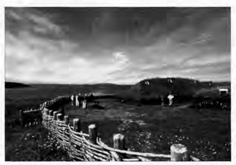
The reconstructed buildings at L'Anse aux Meadows, an early-11th-century Viking site is both a World Heritage Site and part of the system of national historic sites managed by Parks Canada.

This program clearly held out great promise, for it recognized the pivotal role played by provinces and territo-