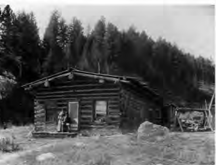
McCartney's log cabin "hotel" at Mammoth Hot Springs, built in 1871. The 1872 bill creating Yellowstone National Park placed this site just a few miles inside the park boundary.

Archeological Center. The portion of the completed Treatment Plan addressing historic sites (Hunt 1993) uses a historic context which is not only elemental to the national park system but also demonstrates considerable potential for broad application outside the system. The context is actually drawn from Yellowstone National Park's 1872 enabling legislation; that