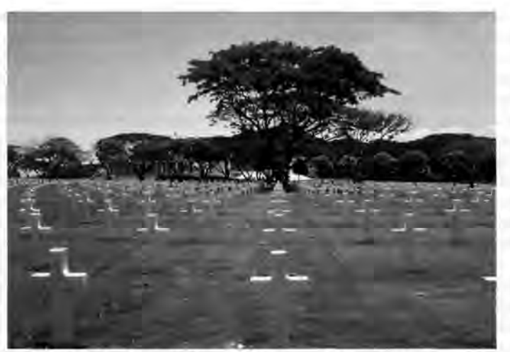
The American Cemetery and Memorial, Manila, The Philippines, 1993.

Today, the route of the Death March can still be retraced. In the towns of both Mariveles, at Bataan's southern tip, and Bagac, located along its western coast, zero-kilometer markers designate the beginning of the ordeal and other mileposts along the way mark the route.