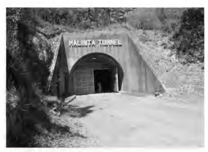
The Malinta Tunnel, 1993.

The Gilbert Islands where Tarawa is located became the staging area for the Americans' next objective: the