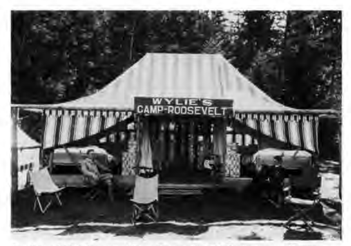
Tourists at Wylie Permanent Camp Roosevelt, 1915.