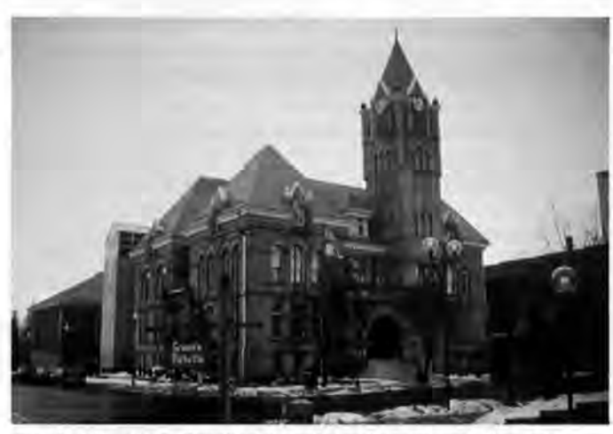
The administration facility (far right) added to the St. Thomas, Ontario, City Hall was designed in 1988.