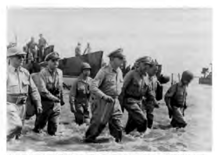
General Douglas MacArthur fulfills his promise to return to The Philippines, October 1944.

The only official memorial to the defenders of Bataan is located at Mt. Samat, near the center of the second American-Filipino defense line. A large cross, 311' high, dominates the height. An elevator permits a view from