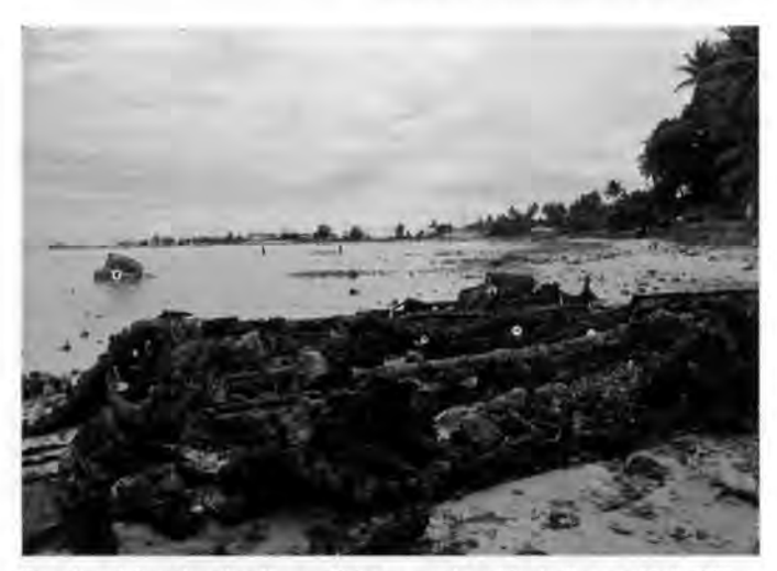
Remains of American landing craft, foreground; and tank, Tarawa Atoll, 1993.