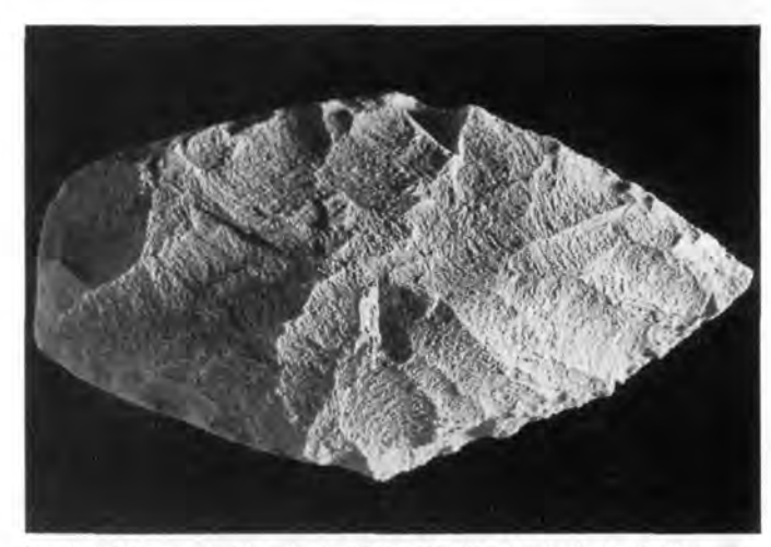
Small Hell Gap projectile point (c. 7,000 B.C.). BICA Archeological Collection.

dreams of perfect arrowheads, maybe some beads, and perhaps even a few grinding stones. What we got, in actuality, was tons of chert flakings, cores, and maybe a few hearth samples. Once in awhile I would come across a partial or even perfect projectile point (the correct terminology of artifacts was also learned in class). After brief congratulations by everyone in class—as if I found the point on the ground and thus a new archeological site—Jon would have us look up the origin of the point and relative dates. I discovered this is what the class was based on: first-hand learning instead of instructor taught. We had to do the research of the history and then tell our fellow interns about it.