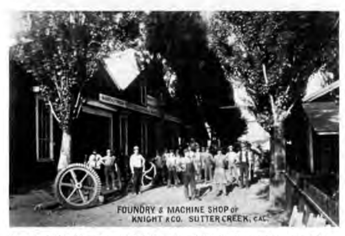
Foundry & Machine Shop, Knight Foundry, Sutter Creek, CA.

Knight Foundry continues to function as the last water-powered foundry and machine shop in the United States. Still using the 42" diameter wheel installed by Samuel Knight in the 1870s, the machine shop is powered by water falling over 400' from the