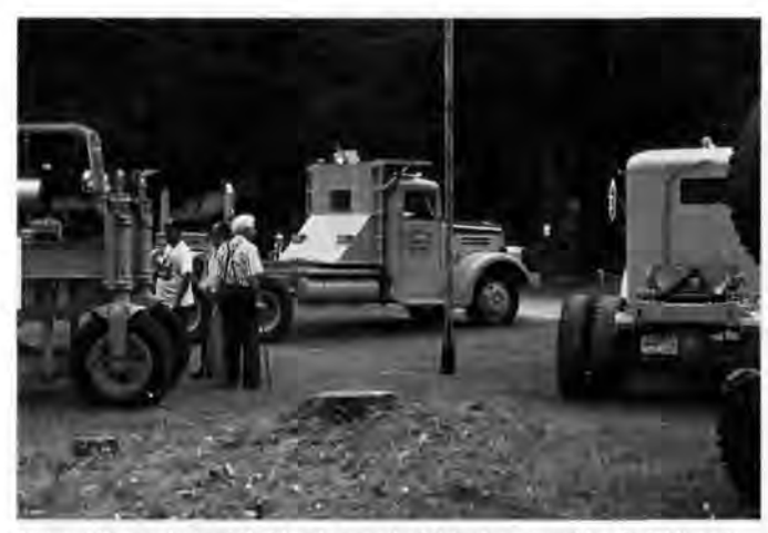
Some of the equipment that has been painstakingly restored by Port Alberni volunteers for display at the mill.

invited Parks Canada and the province to co-operate in a multi-agency development scheme.