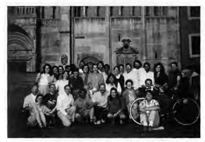
Architectural Conservation Course class photo at Ferrara, Italy. The author is in front row, fourth from left.