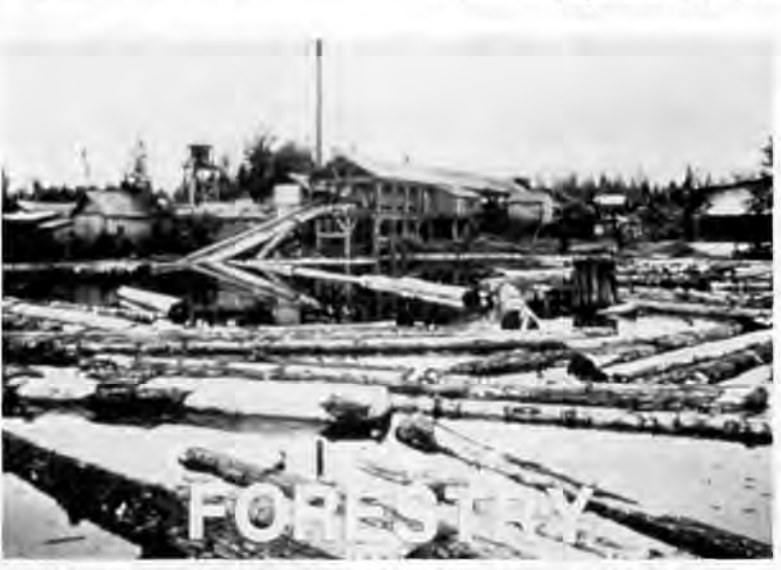
The McLean Mill in Port Alberni, B.C., in the 1930s.

The credible interior layout of the mill property is paralleled by the site's surrounding land use. McMillan Bloedel, a giant lumbering corporation in British Columbia, carries out logging operations in the adjacent highlands. McMillan Bloedel, historically an associate of the McLean family, originally owned the lands encompassing the mill and transferred them to Port Alberni in 1991. The city, in return for the lands, agreed to develop the abandoned structures as a historical site and then