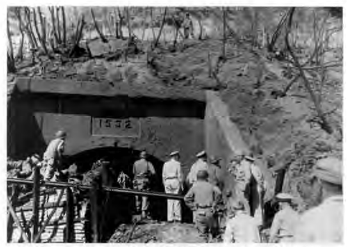
General Douglas MacArthur and staff visit the Malinta Tunnel, Corregidor Island, after its recapture, February 1945.

approximately 4,500 Japanese soldiers on the island at the start of the battle, only 17 surrendered. Seventeen!