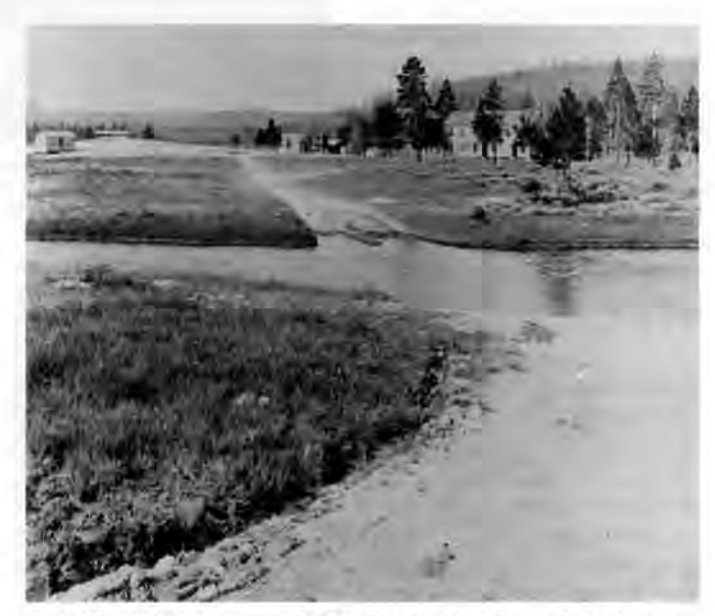
Circa 1888 view of the pioneer Marshall-Firehole Hotel, Lower Geyser Basin.

Historically, tourist populations at Yellowstone have changed dramatically, often within a very short time frame (see Haines 1977). For the first decade or so after the park was created, primitive transportation and support facilities tended to restrict the tourist population to people living near the park and a few very rich from the eastern United States and Europe. Travel assistance was uniformly absent,