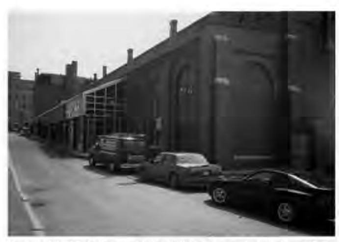
The Saint John Market's economic feasibility was ensured when glass enclosures were erected to provide additional sales space in the building. The HSMBC-designated portion of the structure was the interior, not the exterior.

tional budget. This meant that joint federal-provincial facilities could be planned and built by virtue of federal capital funding, but that operating and maintaining them was the responsibility of the provinces or other partners. This precondition led to the collapse of many negotiations, as operational resources are usually the most difficult for cash-strapped governments to find. Finally, for the Atlantic Provinces, the 50/50 formula for federal cost-sharing proved quite unattractive, particularly when the federal portion for other programs was as much as 90% of the total cost.