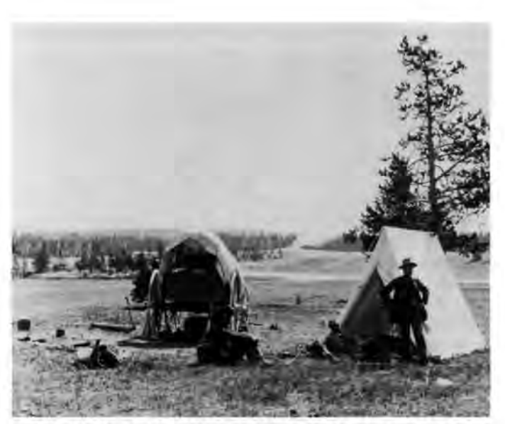
Camping in the Upper Geyser Basin, 1882.