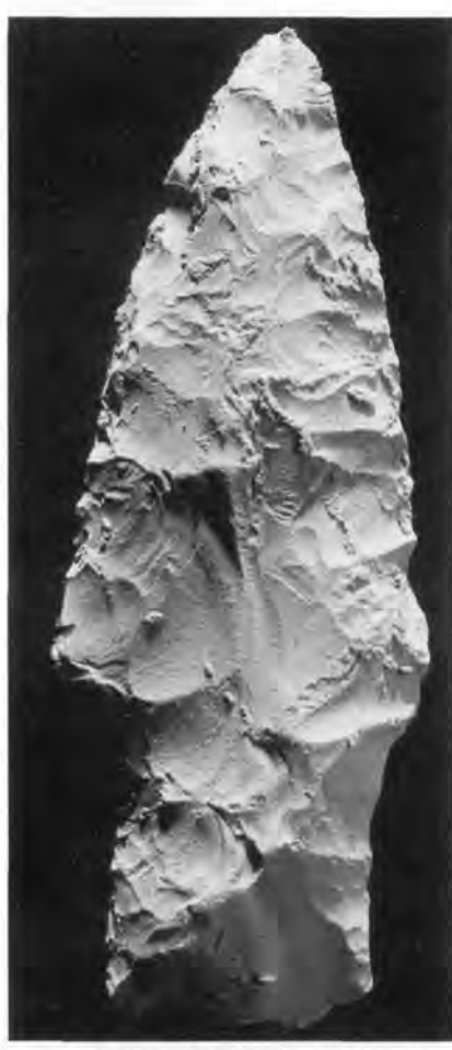
Scottsbluff-like projectile point (c. 6,500 B.C.). BICA Archeological Collection.

the area. Over the past 50 years approximately 612 archeological sites have been located in the Bighorn Canyon/Pryor Mountains complex by professional and amateur archeologists. The sites excavated by Loendorf have vielded an abundance of artifacts treated and studied by the NWC internship class.