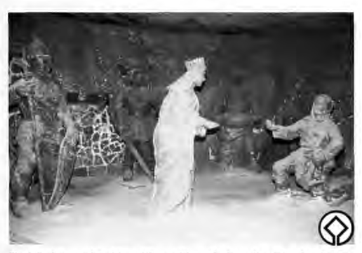
Fig. 4. Sculptures of the blessed Queen Kinga (the legendary "foundress" of the mine) and knights and miners, Wieliczka Salt Mine.

Chapel about 50 m below the surface, pollutant levels are negligible. Although sulfate particles are accumulating on sculptural and wall surfaces, there is no evidence of a lower deliquescence point that would require a target RH much lower than 73%.