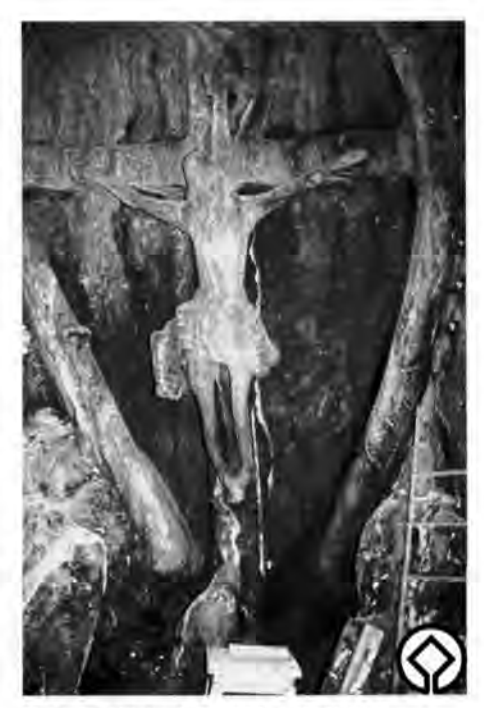
Fig. 2. Crucifixion in St. Anthony's Chapel, Wieliczka Salt Mines, near Cracow; 17th century.

the Maria Sklodowka-Curie Joint Fund II (a bi-lateral science and technology research fund managed by the State Department under the auspices of the US-Polish Joint Commission) and supplementary contributions from the World Heritage Fund-have been undertaken at the Wieliczka Salt Mine World Heritage Site near Cracow and in selected museums in the Central Cracow World Heritage