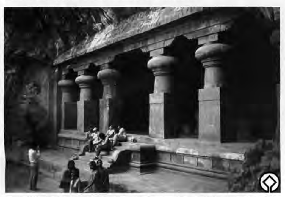
The Hindu Elephanta Caves near Bombay date from the 6th century A.D. Photo by the author (February 1992).