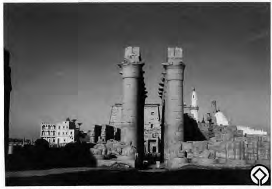
The temple of Ammon, Luxor; 13th century B.C. Photo by Ernest Allen Connally (1963).

Park Site Planning-long and shortrange planning strategies and effective site use and development;