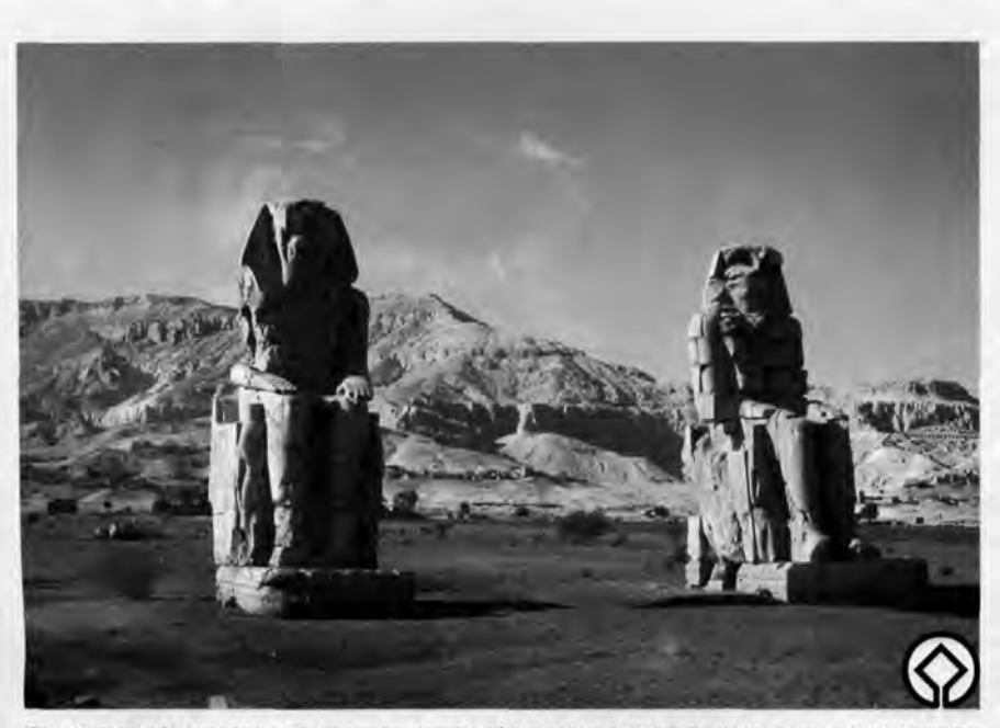
The "Colossi of Memnon" at the mortuary temple of Amenhotep III, Thebes; 14th century B.C.