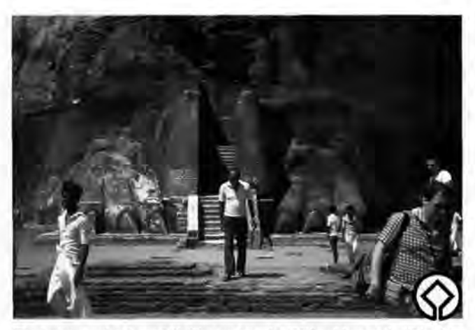
The fortress and palace of Sigiriya on top of a 600' boulder was built in the 5th century A.D. The formal gardens below the rock are the earliest to have survived in Asia. Anuradhapura, Polonnaruwa, and Sigiriya are all within Sri Lanka's Cultural Triangle, which was launched as a UNESCO International Campaign in 1980.

To ensure that ICOMOS's International Scientific Committees are "at the heart of scientific inquiry and exchange in their domains," the Eger Principles (named after an ICOMOS meeting in Eger, Hungary) were rati-