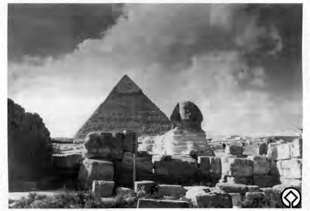
The Sphinx and the 4,600-year-old pyramid of Chephren, Giza.

aspects of cultural resource management and a degree program in archeological resource management that will complement its existing programs in Islamic art and architecture and Egyptology. The program will serve AUC students, EAO staff, and other students and professionals in the North Africa/Middle East region. Our team was to make recommendations on the form