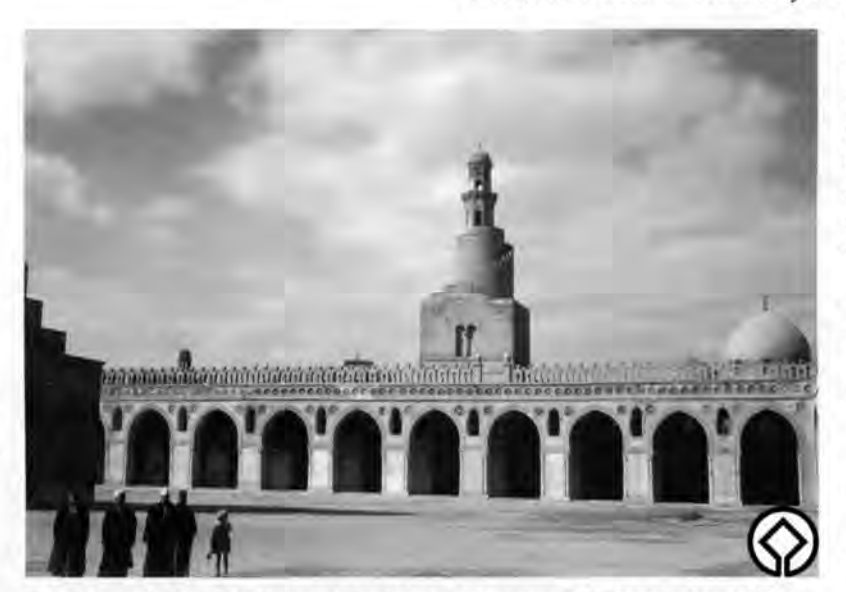
The mosque of Ahmed Ibn Tulun in Islamic Cairo; 9th century A.D.

After our tour of Saggarah we visited the Great Pyramids and the Sphinx. Here, overcrowding of visitors in the monument area and uncontrolled access had been serious problems. The former remains a problem on holidays when a hundred thousand local inhabitants may