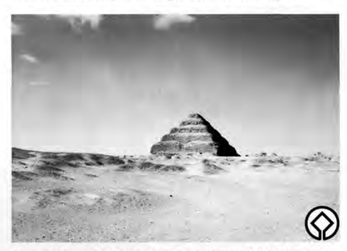
The stepped pyramid of Zoser, Sakkara, was built 2778 B.C. in the form of a mastaba and subsequently enlarged.

The specific impact of this project cannot be measured until AUC develops and implements archeological