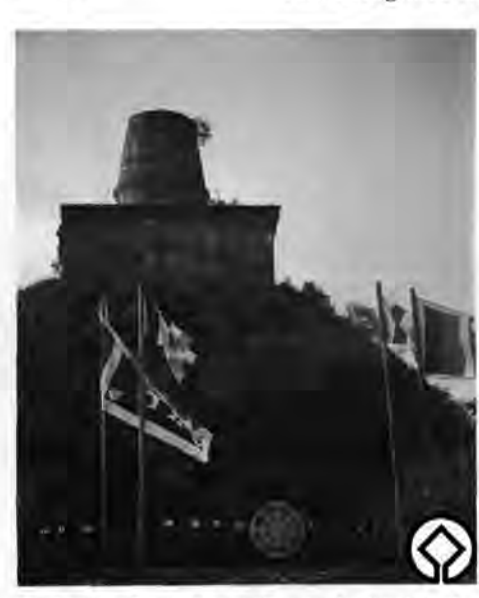
The Jetavana Stupa at Anuradhapura, built of baked brick, was 120 meters in height, making it one of the largest structures of the ancient world. Anuradhapura was a major Buddhist center and a capital from c. 380 B.C. until 993 A.D.