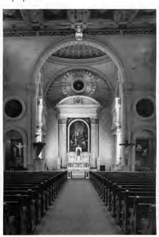
Placed on the National Register of Historic Places in 1973, St. Aloysius Roman Catholic Church on North Capitol Street in Washington, DC, was built between 1857 and 1859. Designed by an Italian Jesuit architect, its impressive interior is now undergoing renovation. The church is also noteworthy for its sanctuary paintings by Constantino Brumidi, who is best known for his frescoes in the dome of the US Capitol.