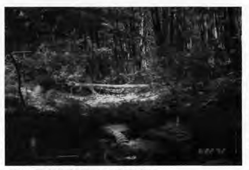
Trace of Forbes Road, near Fort Dewart.

The BHP then drafted a preliminary survey methodology for the identification and evaluation of historic resources, including a universe of anticipated property types: 1) military engagement and fortification sites, 2) military road segments and 3) buildings or standing structures related to the conflict. The preliminary methodology proposed secondary source synthesis, site