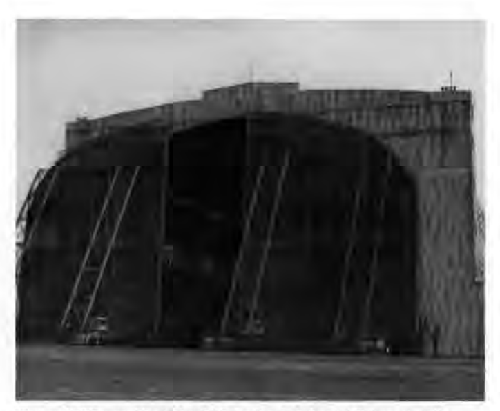
West end of Hangar No. 1, Naval Air Station, Lakehurst, NJ, August, 1969.

wishes to control these efforts and see that all due consideration is given to archeological research, care for potential human remains, and continued federal ownership of submerged aircraft.