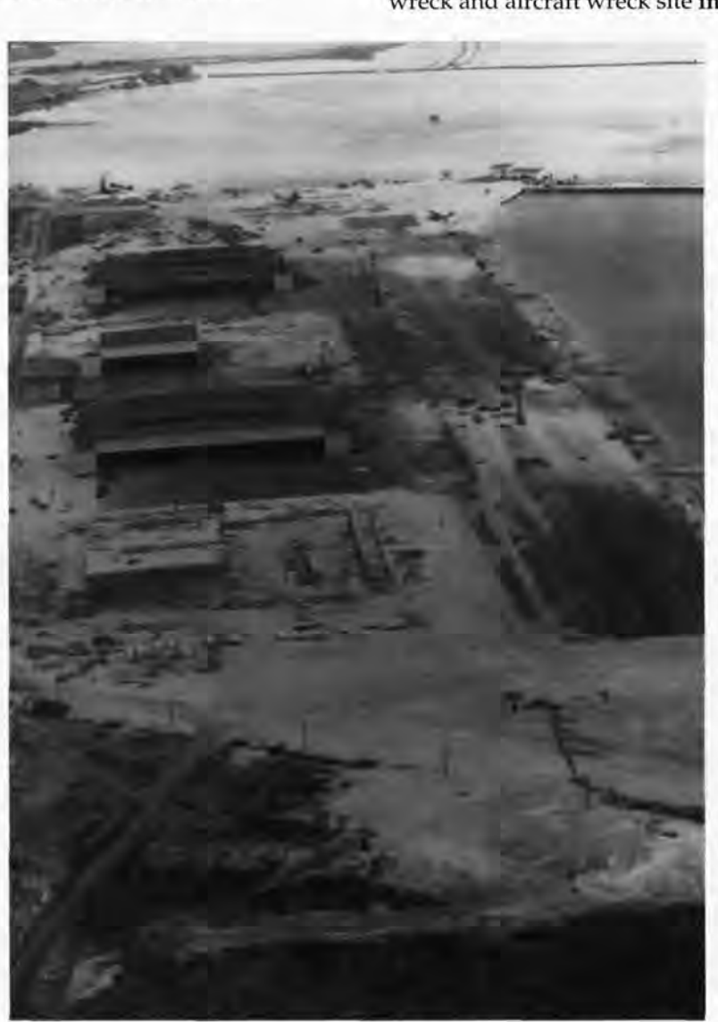
December 9, 1941 aerial view of Kaneohe Naval Air Station following the Japanese attack, Hangar No. 1, at top of photo, was burned out. The small structure immediately below it was later replaced with Hangar No. 2. Hangar No. 3 appears not to have been damaged. Hangar No. 4, at bottom of the photo, was still under construction.

flight condition of rare aircraft. Many aircraft have been collected from lake and ocean bottoms with little question of archeological values or ownership. The Navy