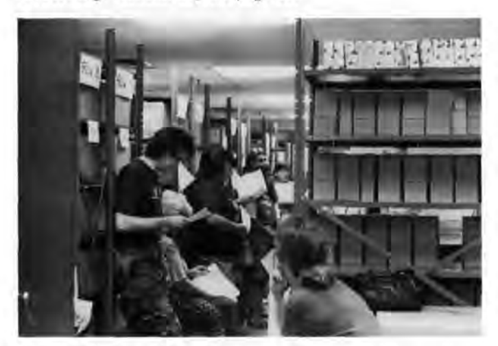
Field trips to local repositories and museums present opportunities to apply new principles.

responsible for the care of museum collections that include a high percentage of archeological and/or ethnographic objects. Individuals who spend much of their work day caring for museum objects but have had minimal training in collections management are strong candidates for selection.