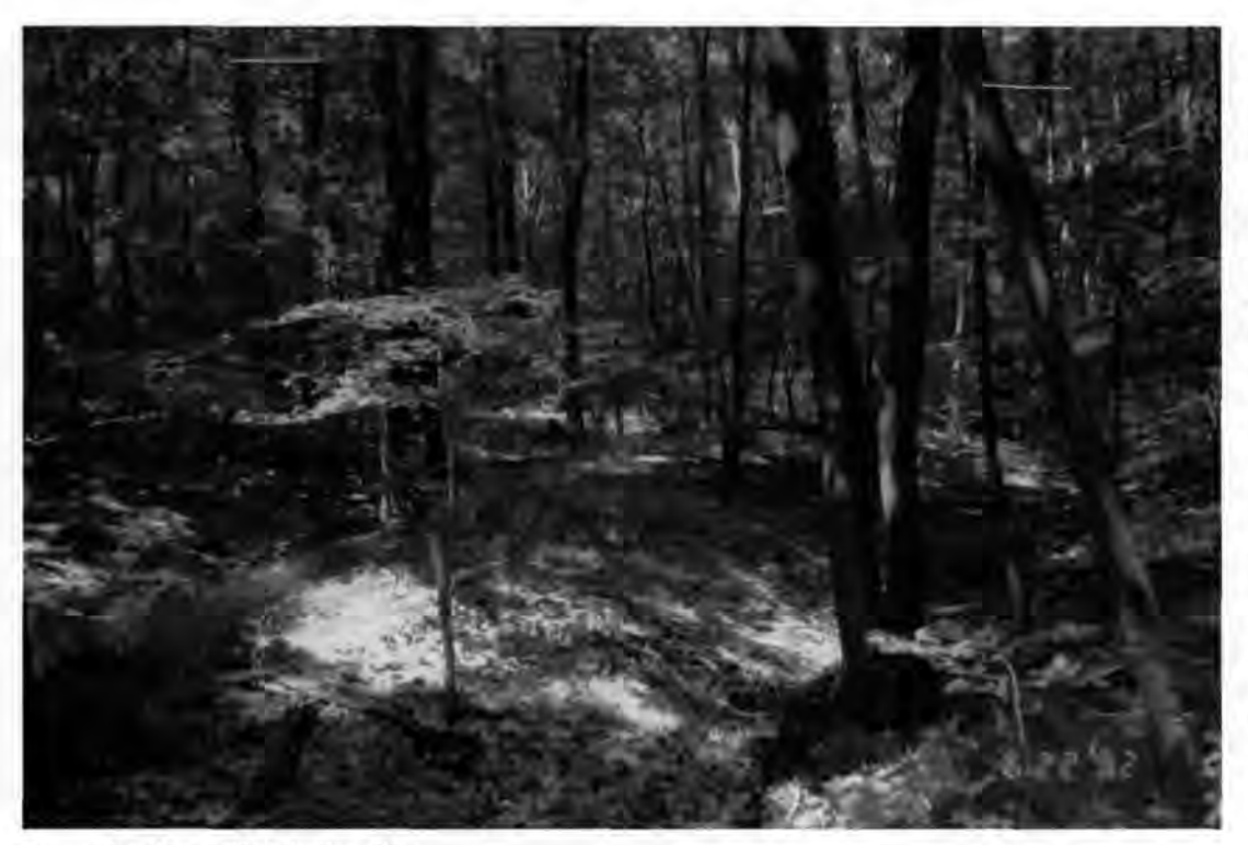
Divergent road traces.

While there were other Forbes Road fortifications that were larger than Fort Dewart, and may still possess archeological integrity, no other such site retains as much above-ground integrity. The features and overall integrity of the Rhor's Gap/ Fort Dewart segment appear to make it eligible for the National Register. Pivotal to this assessment is the uncompromised natural setting and strategic historic value of Rhor's Gap, and the unique survival of the Fort Dewart ramparts, which, together with the roadbed, constitute a considerable resource. In terms of its visible integrity and strategic importance, The Rhor's Gap/Fort Dewart segment of Forbes Road ranks as one of the two or three most significant surviving portions of the entire route.