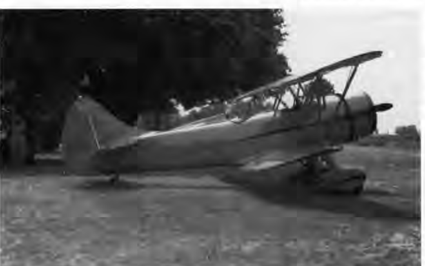
WACO UPF-7 NC 32080 is based in a small central Indiana airfield. Built in 1941, it shows a typical WACO design. Tubular metal struts and interior eliminated the need for elaborate cross bracing wires seen on earlier biplanes.

vey. About 100 requests were sent to specific owners, of which about 35 responses were received by the Division. In retrospect, the Division would have received more responses if better ties to the aviation community would have been established, perhaps through bulletins distributed to airfields, or other "PR" activities. If time would have allowed, arranging for inspections of all 200 aircraft would have been ideal,