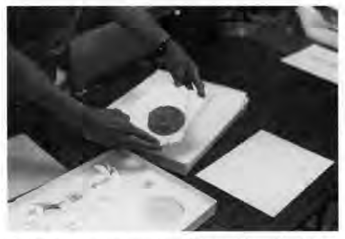
Constructing custom storage mounts was cited as one of the most beneficial sessions of the course.

The course discussed here was adapted from the original pilot training program and is currently funded by the Cultural Resources Training Initiative of the National Park Service (NPS). Since its first offering by the NPS in 1991, 60 participants have completed the course. The