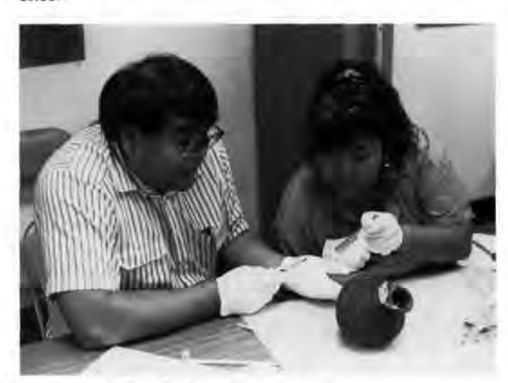
Hands-on practicums are a strong point of the course.

As in preceding years, participants, instructors, and coordinators closed the course with a sense of having experienced something extraordinary. Perhaps the participants gave the best expression of a shared perception in their course evaluations: "I personally feel that the combination of different experiences of the participants contributed a lot to the overall success of the training. Thanks for a memorable, instructive, stimulating experience."