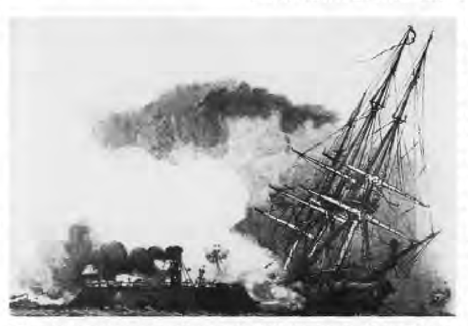
CSS Virginia (ex-USS Merrimack) rams the sailing ship USS Cumberland on March 8, 1862. This action marked the end of the wooden warship as a fighting instrument.

The USS Cumberland, on the other hand, was a full shipped-rigged sailing sloop, built at the Boston Navy Yard and launched in 1842. For the next 20 years, Cumberland served in the Mediterranean, the Gulf of Mexico, and along the African Coast. In 1861, Cumberland was in Gosport Navy Shipyard, and unlike the USS Merrimack which was burned and scuttled, she was evacuated to Fort Monroe. As Fort Monroe served as the staging area for blockading southern ports, Cumberland was deployed to Hatteras Inlet on the North Carolina coast prior to participating in the James River blockade.