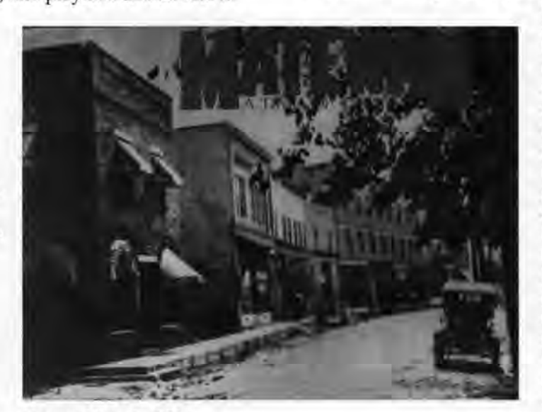
Matewan, Mingo Co., WV.

is illustrative of the status of American race relations of the time. The different racial groups were segregated, with the native whites occupying the choicest dwellings near the tipple, the foreigners in those on the fringes of the settlement, and the blacks in houses that were often separated from the main cluster. Although segregation did not apply inside the mine, there was a hierarchy of occupations. The majority of native whites held the higher paying and more authoritarian positions, such as superintendent, foreman, fire boss; they most often operated the machinery. Some whites were also coal loaders, the lowest occupational category. The foreign born were on the second echelon of the occupational ladder, holding some machine jobs and machine helper jobs and being loaders. Blacks were the lowest on the occupational ladder, rarely having machine or machine helper jobs, and almost always being coal loaders.